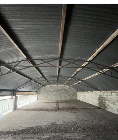
Image No.11 - First Floor