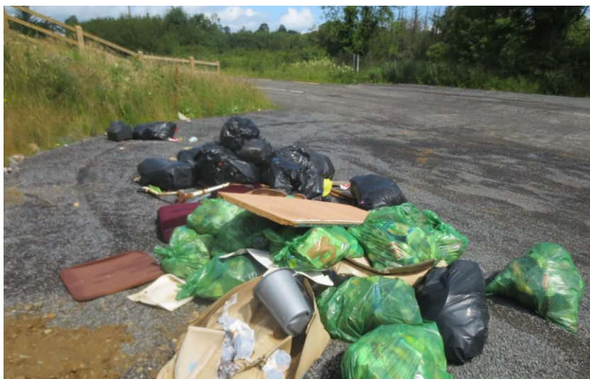
An example of illegal dumping which was observed by the Litter Wardens following a litter complaint

All complaints that are received will continue to be recorded and fully investigated in a prompt manner. Cavan County Council will initiate appropriate action through enforcement of the Litter Pollution Act 1997 as amended. We will implement the Polluter Pays Principle in respect of litter and waste. A designated telephone number and further contact details to assist the public will be displayed on all Litter Warden vehicles.