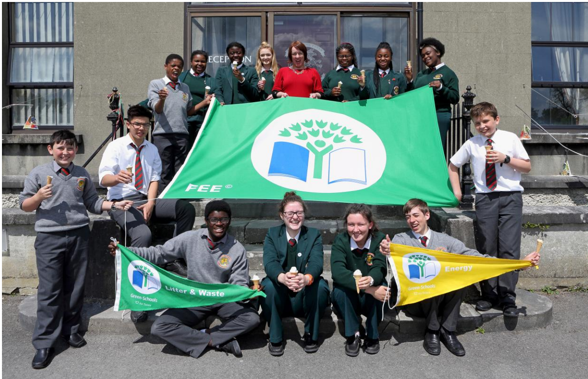
Pupils from the Royal School in Cavan Town celebrating the awarding of their second green flag in June 2016

The litter staff will continue to visit schools throughout the year to raise awareness of the harmful effects of litter and graffiti. This ensures educational benefits and awareness fostered at primary and secondary level will be retained by pupils for the long term. Cavan County Council will provide educational materials and posters on litter awareness and provide equipment to support schools' participation in anti-litter initiatives such as National Springclean and Gum Litter Campaign.