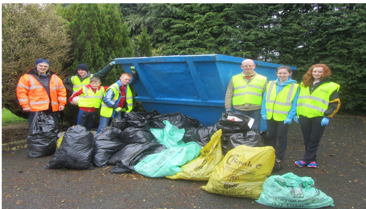
Group from Kilnaleck Tidy Towns undertaking a community clean up in 2016

Cavan County Council will continue to support local communities throughout the year in relation to local clean ups.