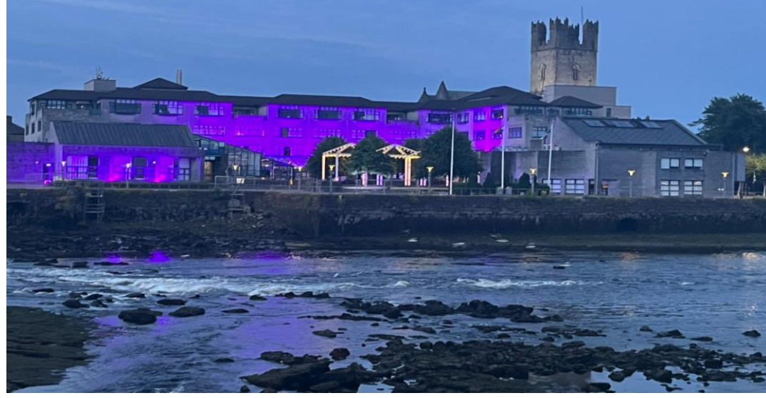
Our Headquarters at City Hall, Merchants Quay also lit up purple in recognition of World Elder Abuse Awareness Day.