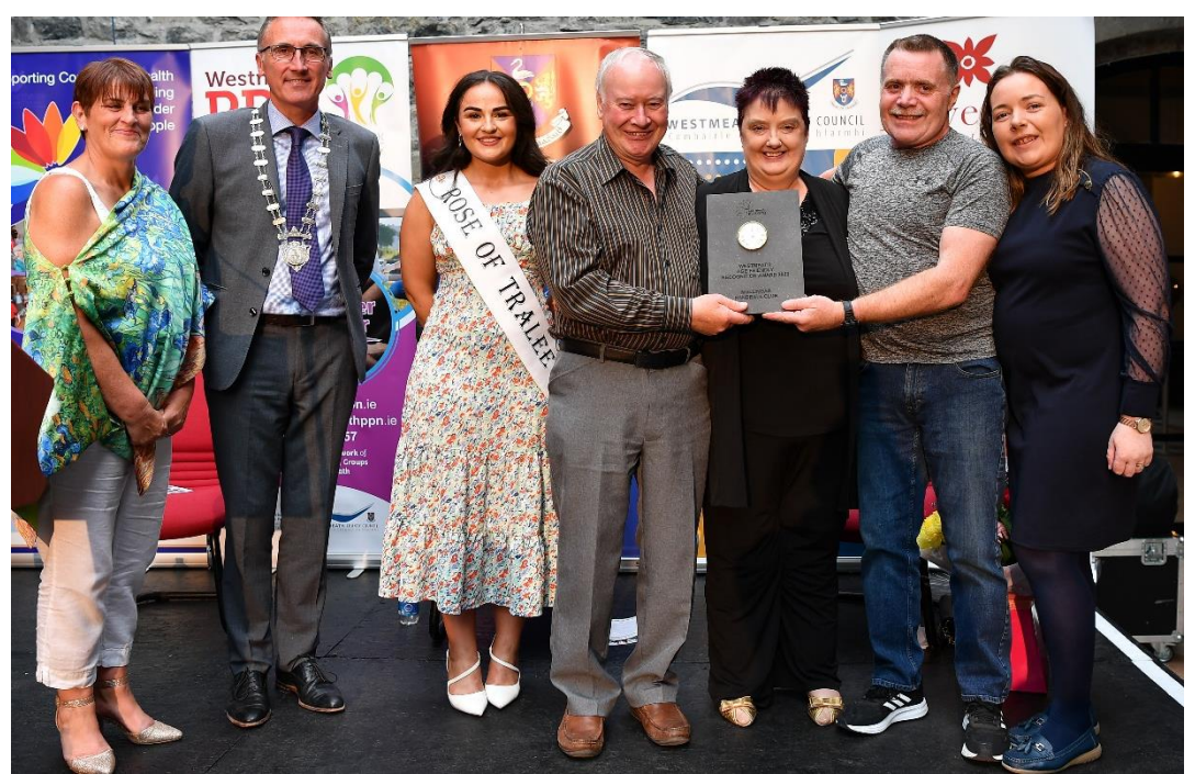
So, all of you out there remember its never too late to take up sports again – this just might be the one for you.

Our first shortlisted group are Mullingar Handball Active Age Group have members between the ages of 60 and 80 who meet to play handball and partake in physical activity once per week in the club. For some of the members this is the highlight of their week and the only night of the week they actually get out to socialise. Following their handball and exercise sessions, they retire to the kitchen where they sit for chats and tea. The group are planning to host a weekend festival in the club. The festival is to include a workshop with a personal trainer to advise older players of the appropriate exercises for their ability. It will include an introductory session for new members. It will include a fun social noncompetitive tournament, followed by dinner and a trad session in a local hotel. The group would like to extend an invite for new members, to members of other clubs in Westmeath and also our surrounding Counties.