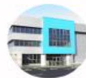
Leabharlann Phobail Gaoth Dobhair