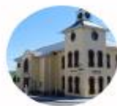
Central Library Letterkenny