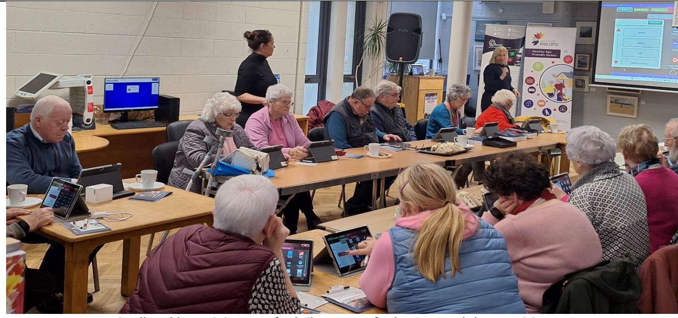
Photo 2: ACORN Age Friendly Tablet Training, Longford Library, Longford Town- workshop participants.

If you would like more information on the Healthy Age Friendly Programme you can visit https://agefriendlyireland.ie/category/healthy-age-friendly-homes-programme/introduction/ or phone our national office at 046 9248899