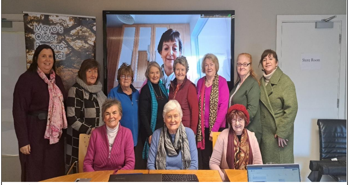
Mayo's OPC Executive

At last meetings of 2023 both the OPC Executive and Age Friendly Alliance agreed and look forward to delivering new actions and initiatives under the Age Friendly Programme for Q1 2024.