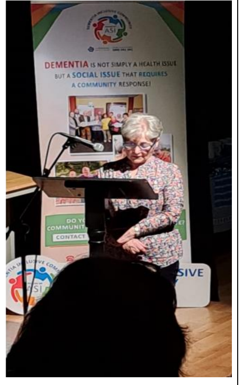
Cavan Dementia Inclusive Community Initiative took place this week.