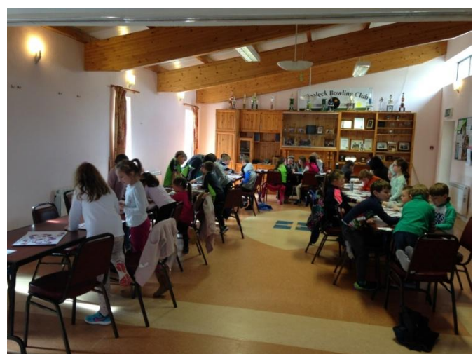
Workshops and support provided for young people under the SICAP Programme in Kilnaleck.

For the remainder of 2017 the programme will focus on community development, progression of groups and additional work with young people who are 'Not in Education, Training or Employment' [NEETs].