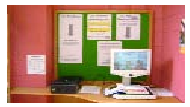
Assistive & Adaptive Computer Technology Library