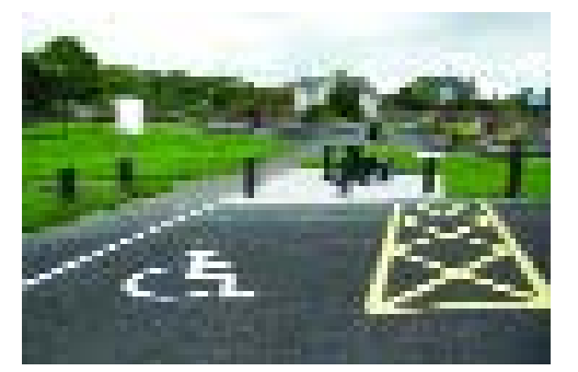
Belturbet Playground Accessible picnic table & parking