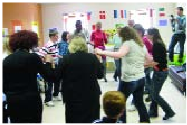
Comhairle na nÓg Multi-Cultural Event 2009