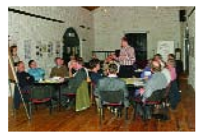
Public Consultations for the County Development Plan