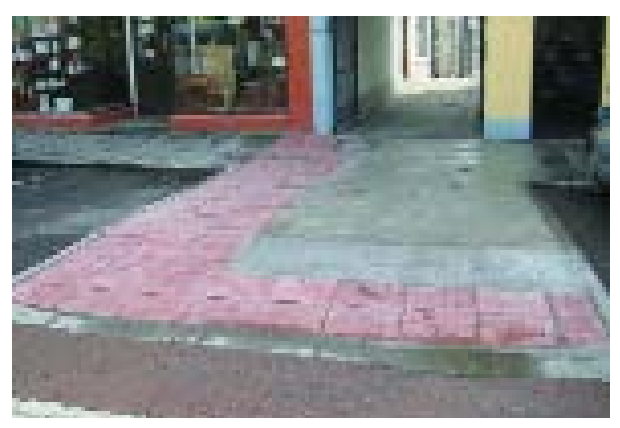
Tactile Paving at Pedestrian Crossing in Cootehill

Effective social inclusion results in each individual having an equal opportunity to make decisions that affect their quality of life. It ensures the fullest participation of all members of the community including minority groups such as Travellers, older people, disabled people, refugees, asylum seekers, economic migrants, gay/lesbian/bisexual people etc. in decision making processes. By agencies (such as local authorities, health boards etc.) promoting and actively pursuing social inclusion policies, all people within a community can be supported and encouraged to participate in the life of their community.