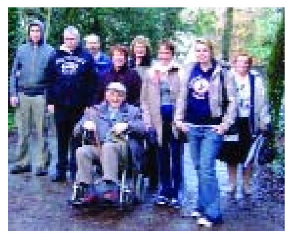
Participants of the Cross Border Project - County Museum