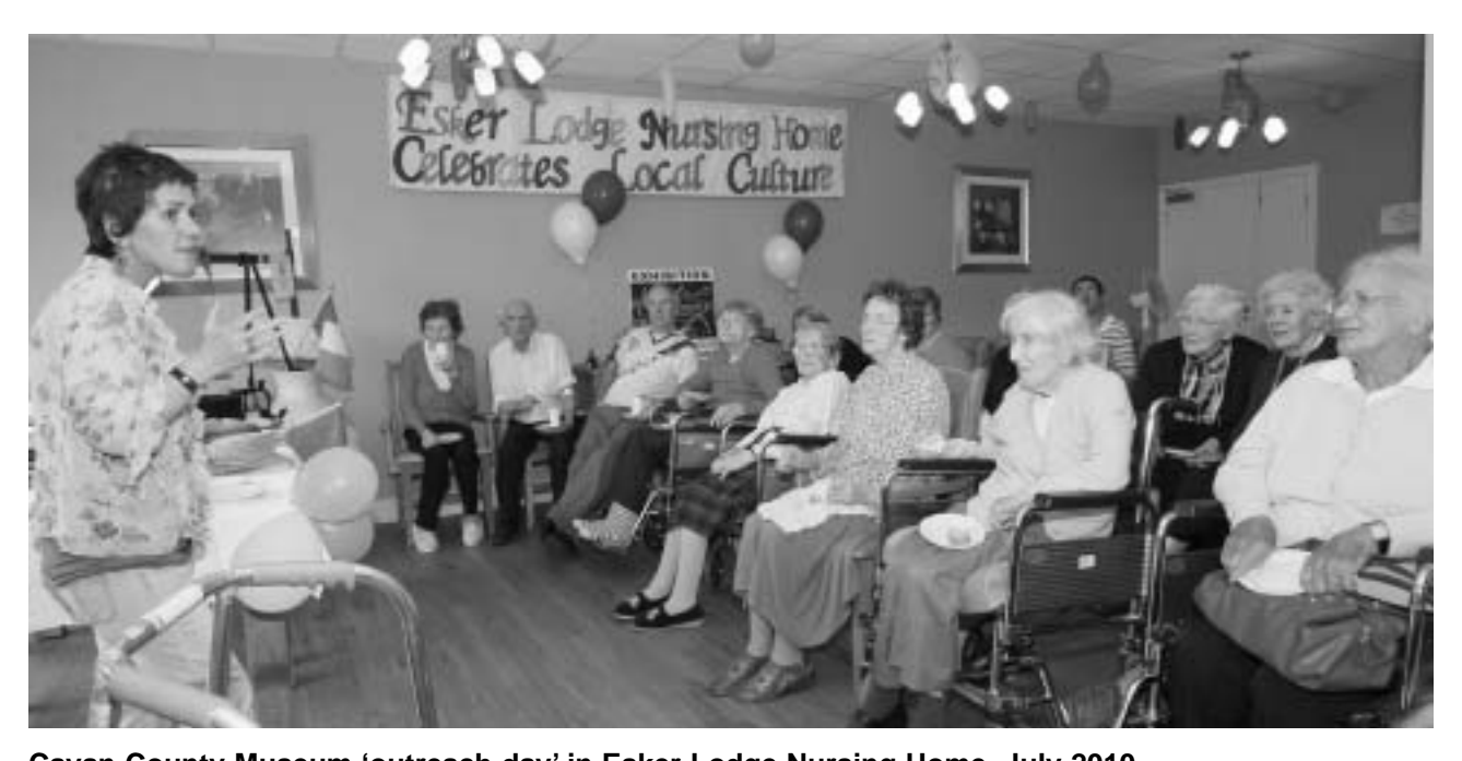
Cavan County Museum 'outreach day' in Esker Lodge Nursing Home, July 2010