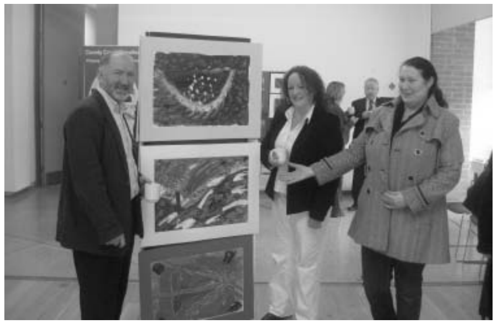
Cavan Primary Health Care Team for Travellers was supported by the Health Service Executive and the Department of Social Protection. The project provided a range of accredited and soft skills training for Traveller women to equip them to work within their own communities