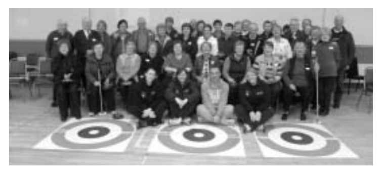
Sports inclusion events are organised by Cavan Sports Partnership to encourage people to participate in sports