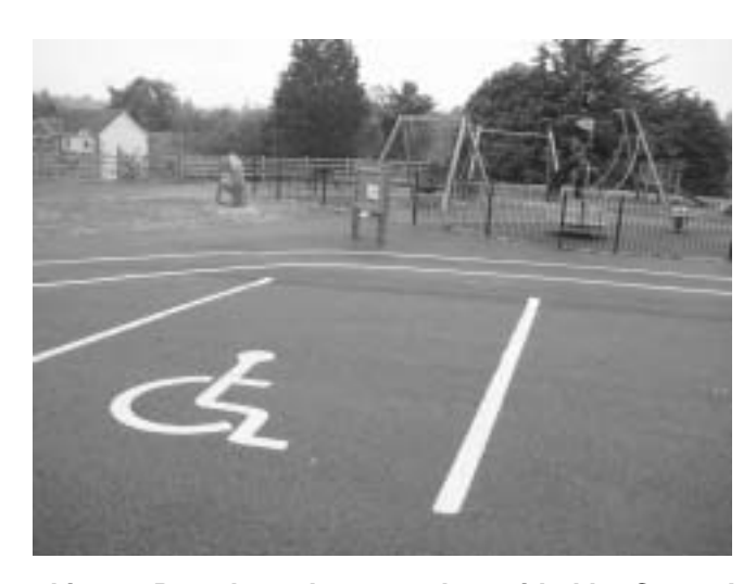
Accessible car parking at Bawnboy playground provided by Cavan Local Authorities