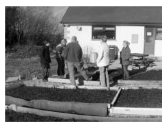
The West Cavan Gardening Group supported by Community Connections

During consultation sessions for this anti-poverty strategy, many successful examples were identified of women's groups operating in the county. Community and voluntary groups reported having better engagement from women in various services including education opportunities. However, it may be the case that women who engage with such structures are from more advantaged backgrounds than women who do not engage or who are isolated in their communities.