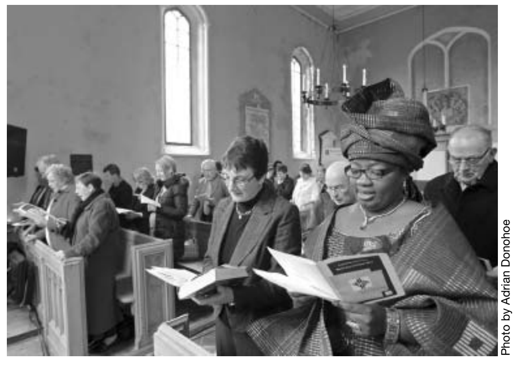
Participants at the World Day of Prayer event held in Castlesaunderson Church in March 2011

Angels Family Support Group provides a safe, confidential and non-judgmental place for the family members of drug and alcohol users to come together to discuss common issues. The group is dedicated to outreaching and organising respite care, counselling, education, support and guidance to people affected by addiction, whether directly or indirectly. It is dedicated to the holistic development of the person, the family and the community, achieved through therapeutic intervention and peer support. Angels Family Support is one of seven groups operating in the north east region, all linked to the North East Region Family Support Network. The group holds weekly meetings where members share their experiences and have the opportunity to listen to guest speakers.