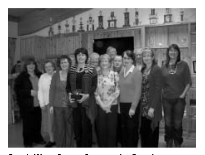
South West Cavan Community Development Project 'Making a Difference' Awards