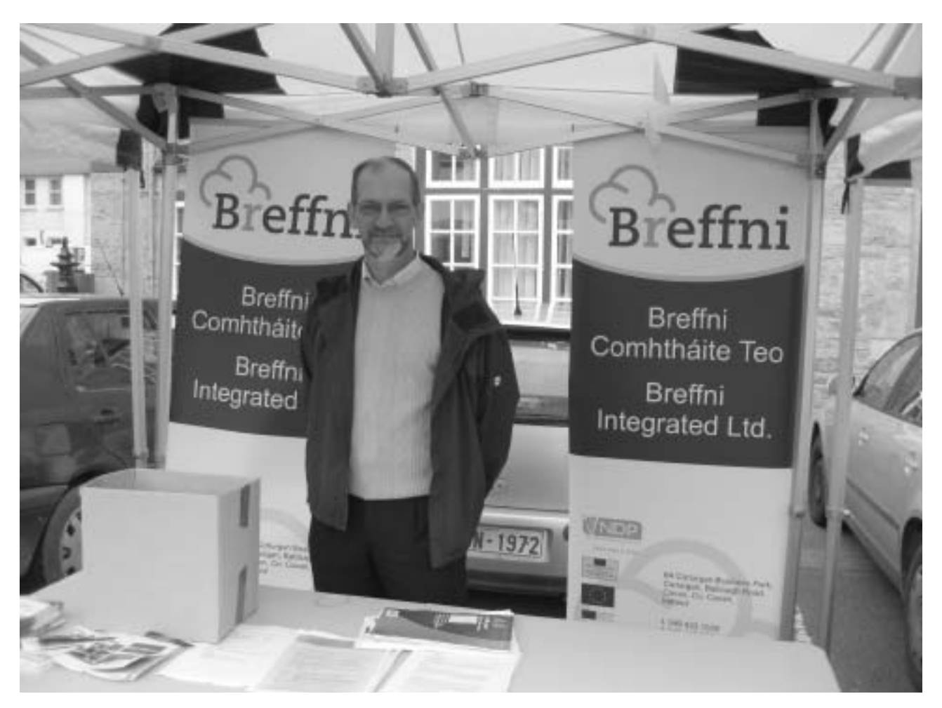
The smallholder support service provided by Breffni Integrated Limited at the Cavan Town Farmers Market during Social Inclusion Week 2010