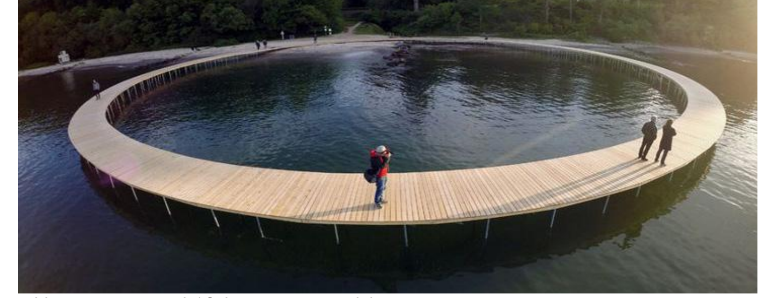
Public swimming pool / fishing pontoon in lake