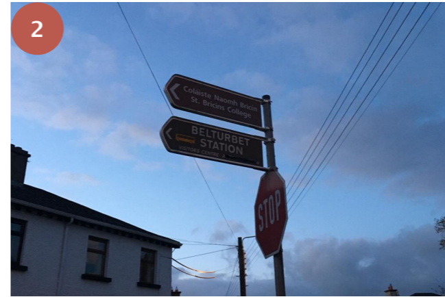
Signage and Wayfinding