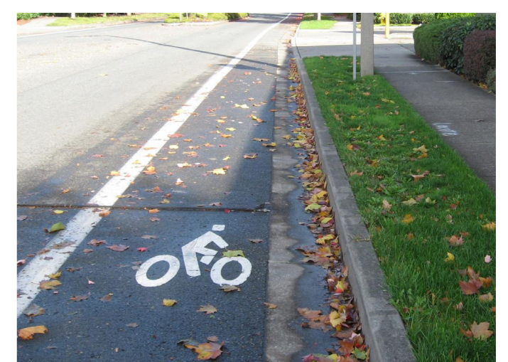
Opportunity to provide cycle amenities