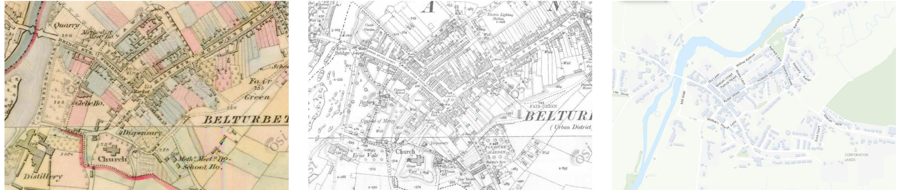
Figure 20.1.3 - Maps from 1800, 1900 and 2017

Belturbet's location is historically one of the best places for crossing the River Erne. When the Anglo-Normans tried to conquer Cavan in the early 13th century, Walter de Lacy built a motte-and-bailey on Turbet Island. The fort was probably made of wood and has not survived, although the steep mound of earth where it was built can still be seen.