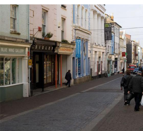
Opportunity to create pedestrian friendly street