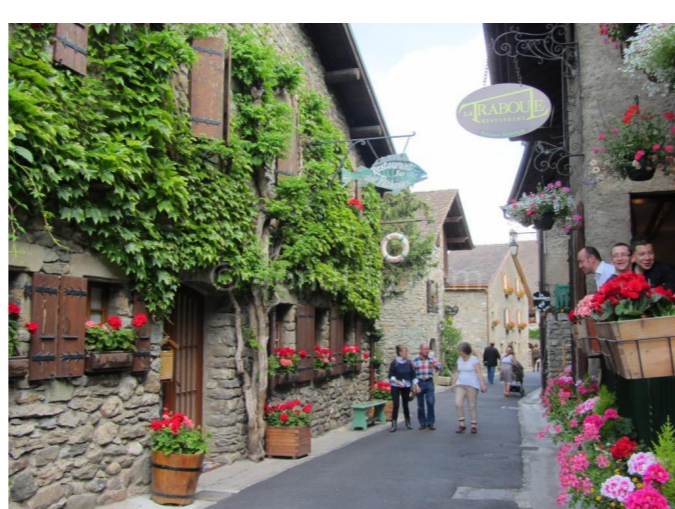
Opportunity to improve public realm with local materials and plant species