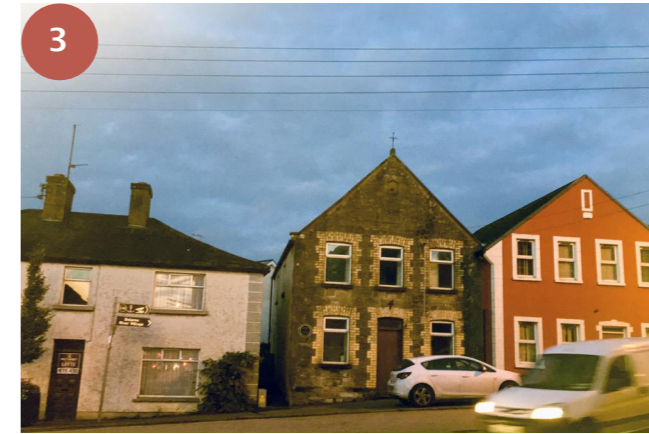
Unique character should be retained