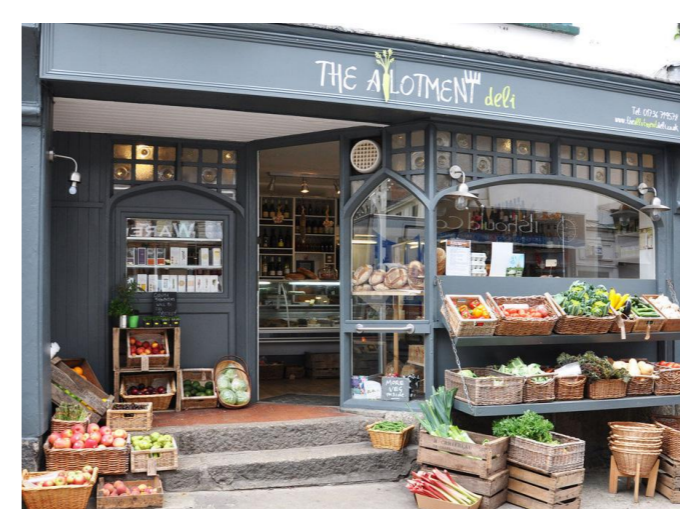
Opportunity to re-purpose abandoned buildings