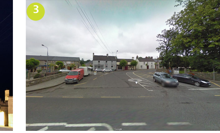
Oppertunity to connect park with square as pedestrian environment