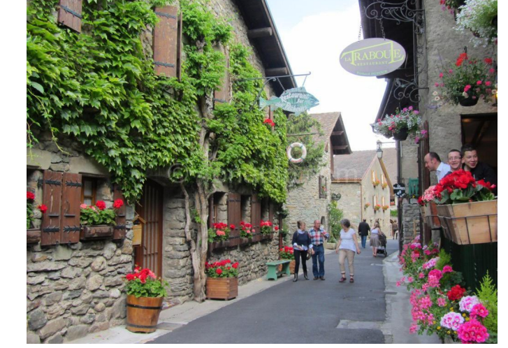
Opportunity to improve public realm with local materials and plant species