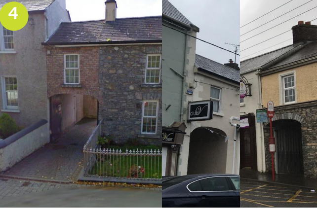
Opportunity to use the existing archways to increase permeability