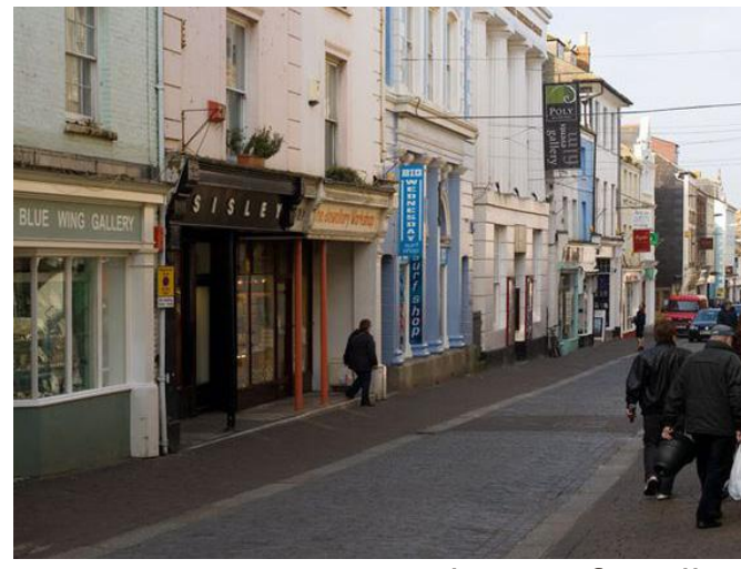
Opportunity to create pedestrian friendly street