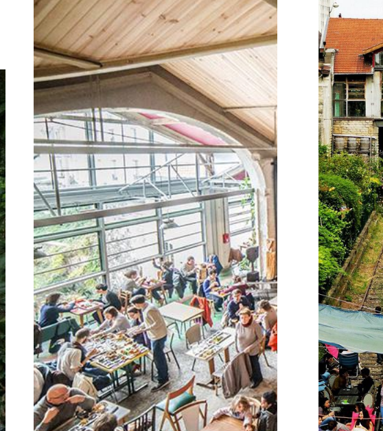
Opportunity to refurbish industrial heritage