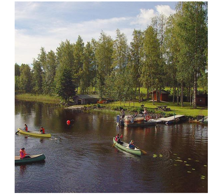
Opportunity to create a leisure space along Lough Ramor