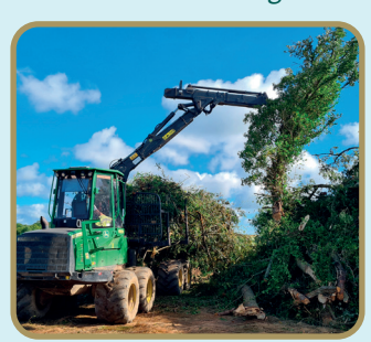
Off-Site Energy Use