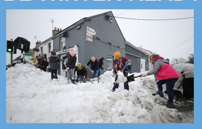
You, Your Community, and the Winter