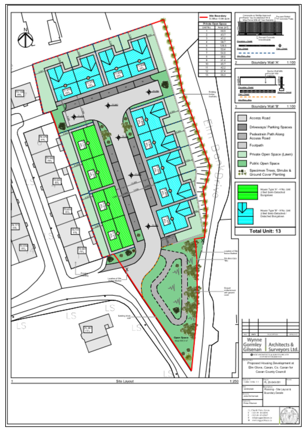
FIGURE 2: Plan of proposed development