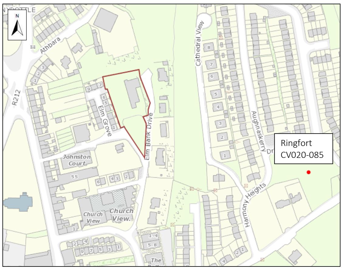
FIGURE 3: Recorded monuments in the vicinity of the proposed development area

The proposed development is located at Elm Grove, within Cavan town, County Cavan. It lies outside the zone of archaeological potential for the historic core of Cavan. There is one recorded monument within the vicinity of the proposed development area, a ringfort (CV020-085), located c. 213m east-southeast (Figure 3).