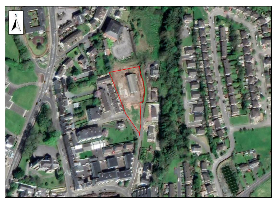
FIGURE 6: Recent satellite imagery of the proposed development area (after Google Earth 2020)

The construction of the existing industrial development on the site has led to significant disturbance within the development area and the southern portion of the