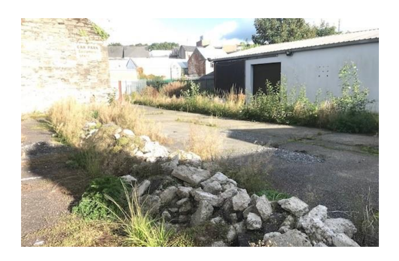
Fig. 2 Native Ivy on gable of building under survey

Fig. 1 Ruderal weeds and grass in archaeological trenches