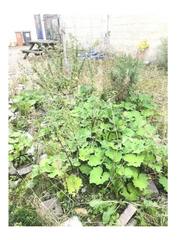
Fig. 5 Native plants on spoil from test trench.

Fig. 4 Coltsfoot among the plants of spoil behind the Credit Union building.