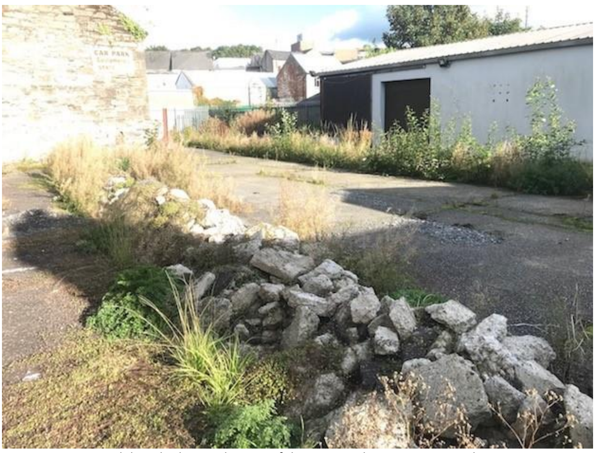
Bare and disturbed ground in one of the areas under survey, September 2022