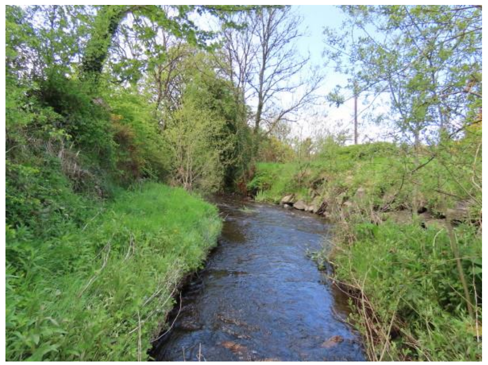
Photo 13 – riverbanks downstream of bridge. Banks surveyed for signs of otters