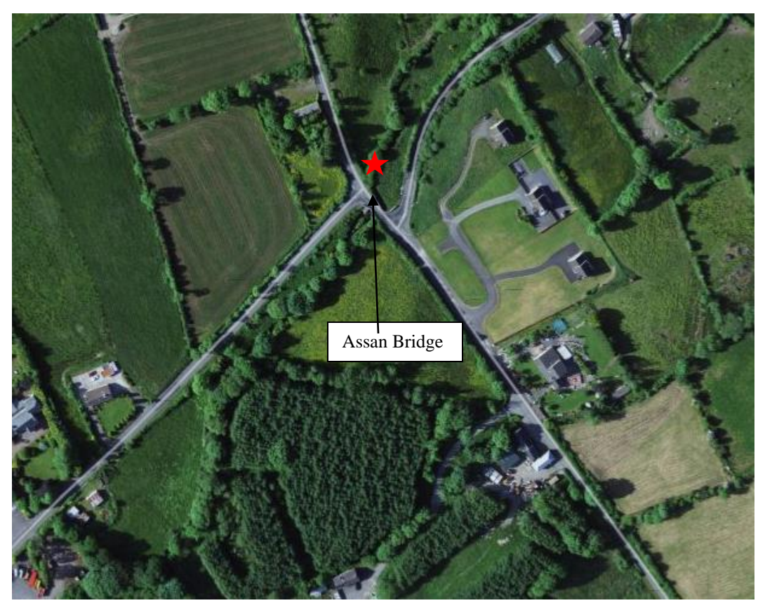
Figure 1 – aerial photo showing the location of Assan Bridge and proposed location of new bridge (red star).

Watercourse: Not named Species recorded: None