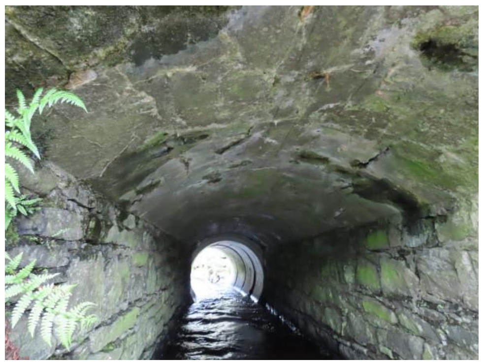
Photo 11 – showing shuttered concrete grout on undersurface of northern arch