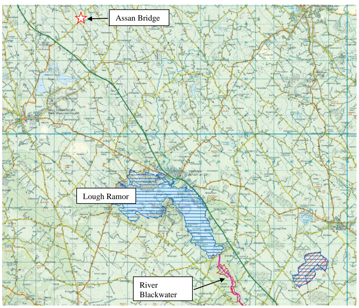
Figure 2 – showing distance from Assan Bridge to Lough Ramor pNHA (c. 11km downstream - blue hatching) and distance to outflow of River Blackwater at south east corner of lake (c. 15km downstream - River Blackwater is a component river of River Boyne and River Blackwater SAC 002299 – red hatching)

A small bridge at an important junction with two approach roads on either side, in a prominent location that can be seen from several directions. The bridge has a robust character, and the rough faces contrast with the cut stone arches. The bridge retains much of its original material and form despite the very unsympathetic additions to the north arch and replacement of some wing walls. It makes a significant contribution to the architectural character of its setting."