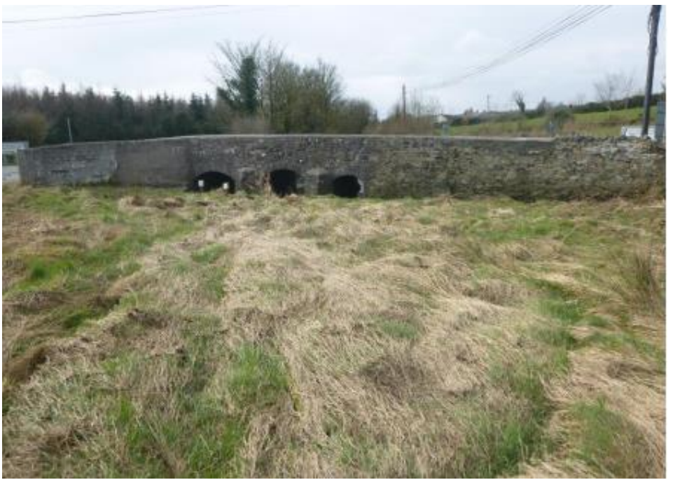
Photo 3 – area upstream of Assan Bridge where new bridge will be constructed. The course of the river will be altered so that it approaches the bridge directly as opposed to the current situation where it approaches the bridge from the north-west and flows along the bridge wall before turning south under the bridge.