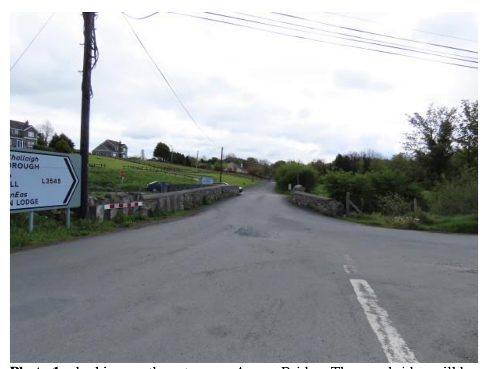
Photo 1 – looking south east across Assam Bridge. The new bridge will be constructed c. 25m upstream of the existing bridge