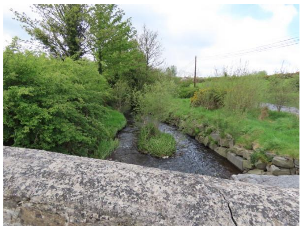
Photo 8 – view downstream from existing bridge showing rock armour on western river bank