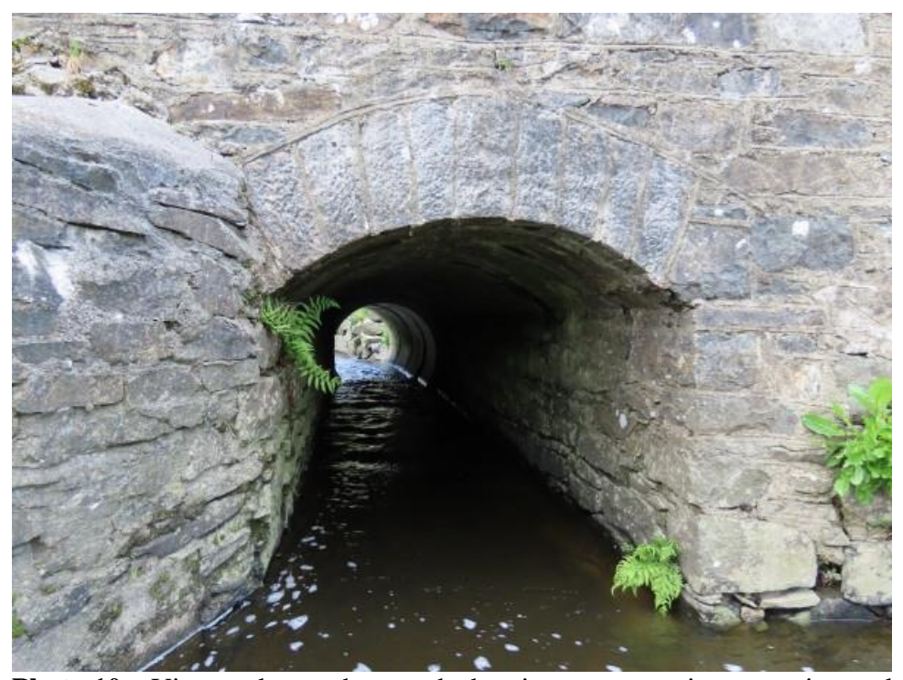
Photo 10 – View under northern arch showing concrete pipe extension at downstream face