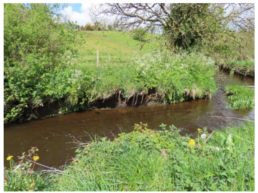
Photo 6 - river banks upstream of bridge surveyed for signs of otters