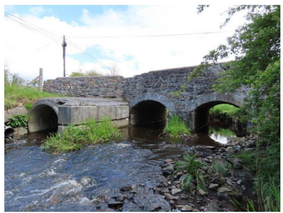
Photo 12 – downstream elevation showing concrete pipe extending beyond other two arches