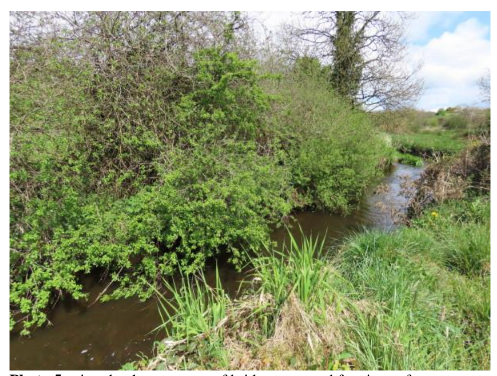
Photo 5 - river banks upstream of bridge surveyed for signs of otters