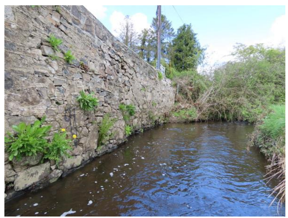
Photo 4 - cracked masonry wall upstream of bridge. Watercourse flows along this wall before turning south under the bridge.