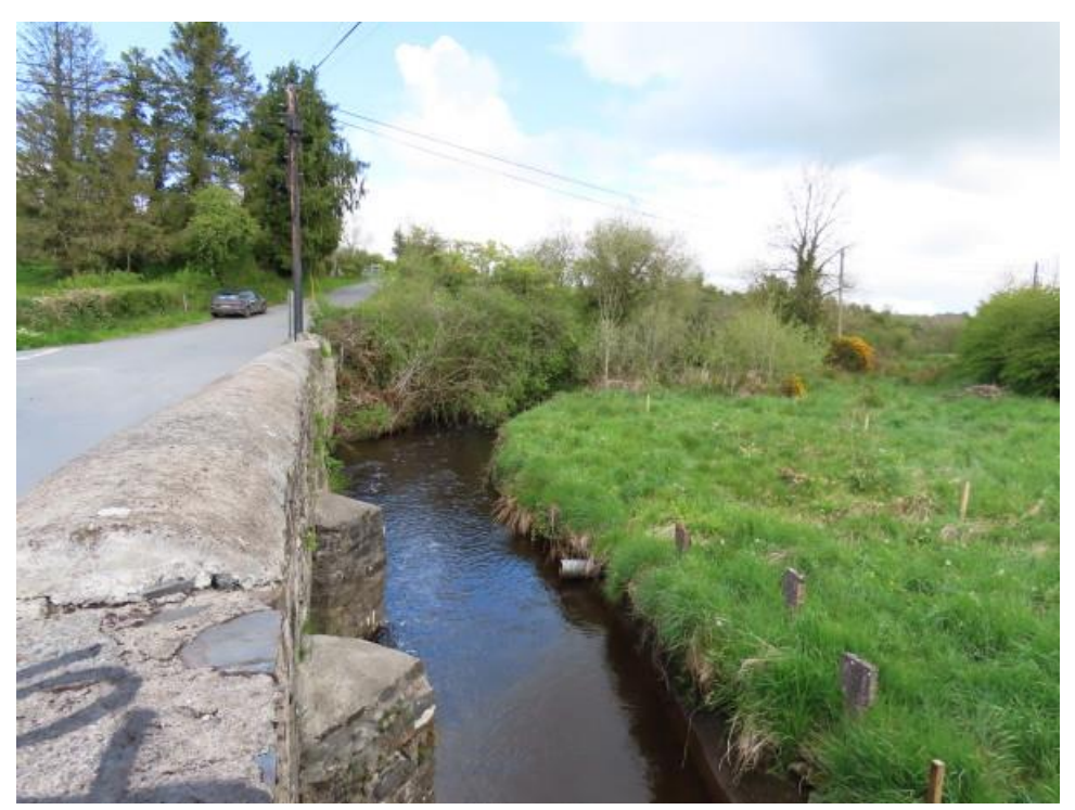
Photo 2 - view of watercourse upstream from bridge showing current course of river. The course of the river upstream of the bridge will be altered so that it flows directly under the bridge