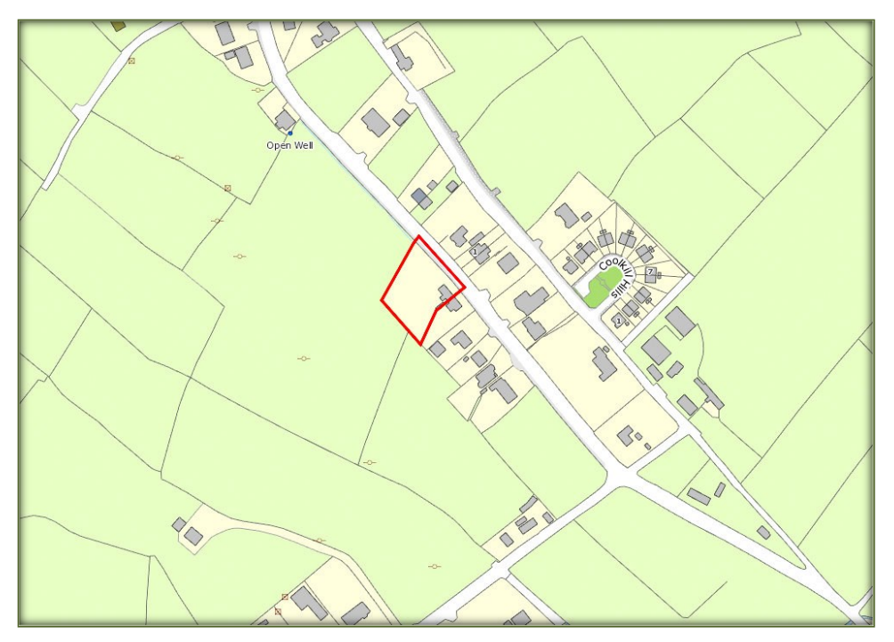
Figure 3 – Site Location Map (Site Outlined in Red)