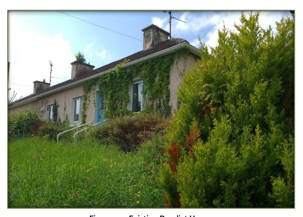
Figure 5c – Existing Derelict House