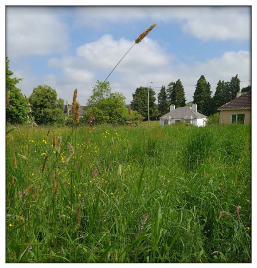
Figure 5a – Photo of the Back Garden Area Looking Towards the Existing Dwelling