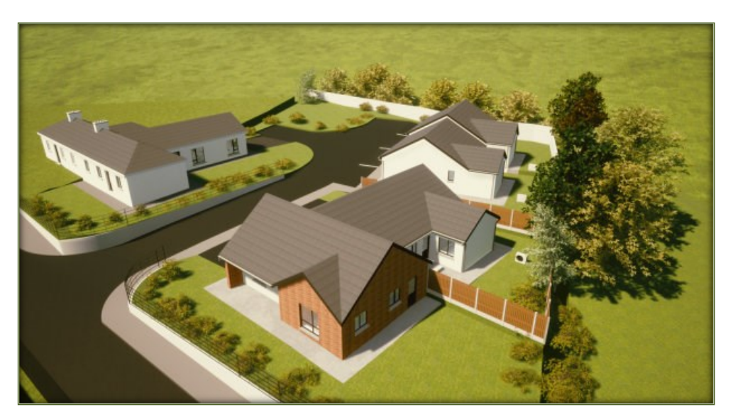
Figure 1b – Proposed Overview (as prepared by WGG Architects)