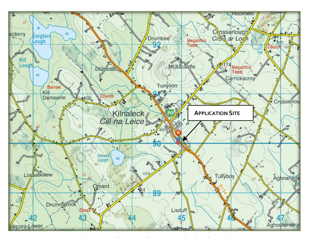
Figure 2 - Site Location Map (Site is Pinned)

The predominant land-use close to the site consists of the urban fabric of Kilnaleck town (predominantly residential, commercial and amenity areas) which lies to the north and west of the site. The dominant habitats associated with these areas include buildings and artificial surface and amenity grasslands and gardens. In the rural areas beyond Kilnaleck, low intensity agriculture is the dominant land use and improved / semi-improved agricultural grasslands are the dominant habitats. Other habitats represented in these areas include coniferous woodlands, small areas of broadleaved woodland and scrub, wet grasslands, hedgerows, treelines and watercourses. Site location maps are shown in Figures 2 and 3.