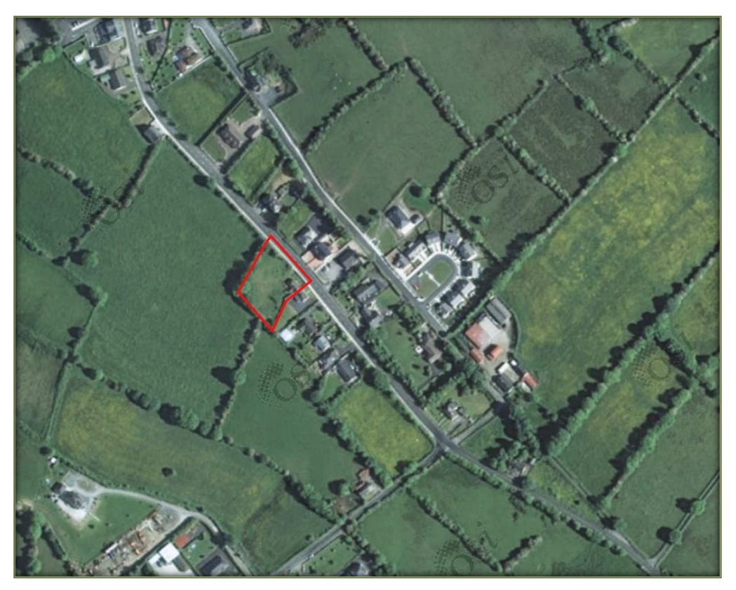
Figure 4 - Aerial Photographs of the Site (Outlined in Red)