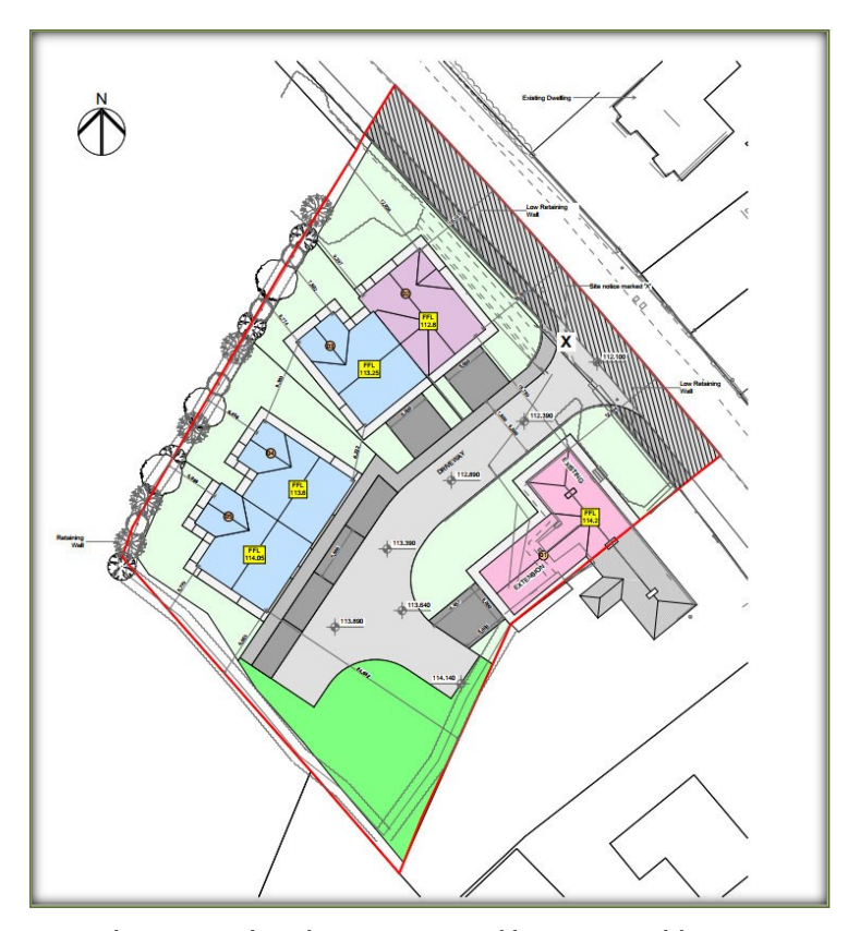
Figure 1a —Site Plan (as prepared by WGG Architects)

Permission for these works will be sought under Part VIII of planning process. An extract from the site plan is outlined in Figure 1a and 1b.