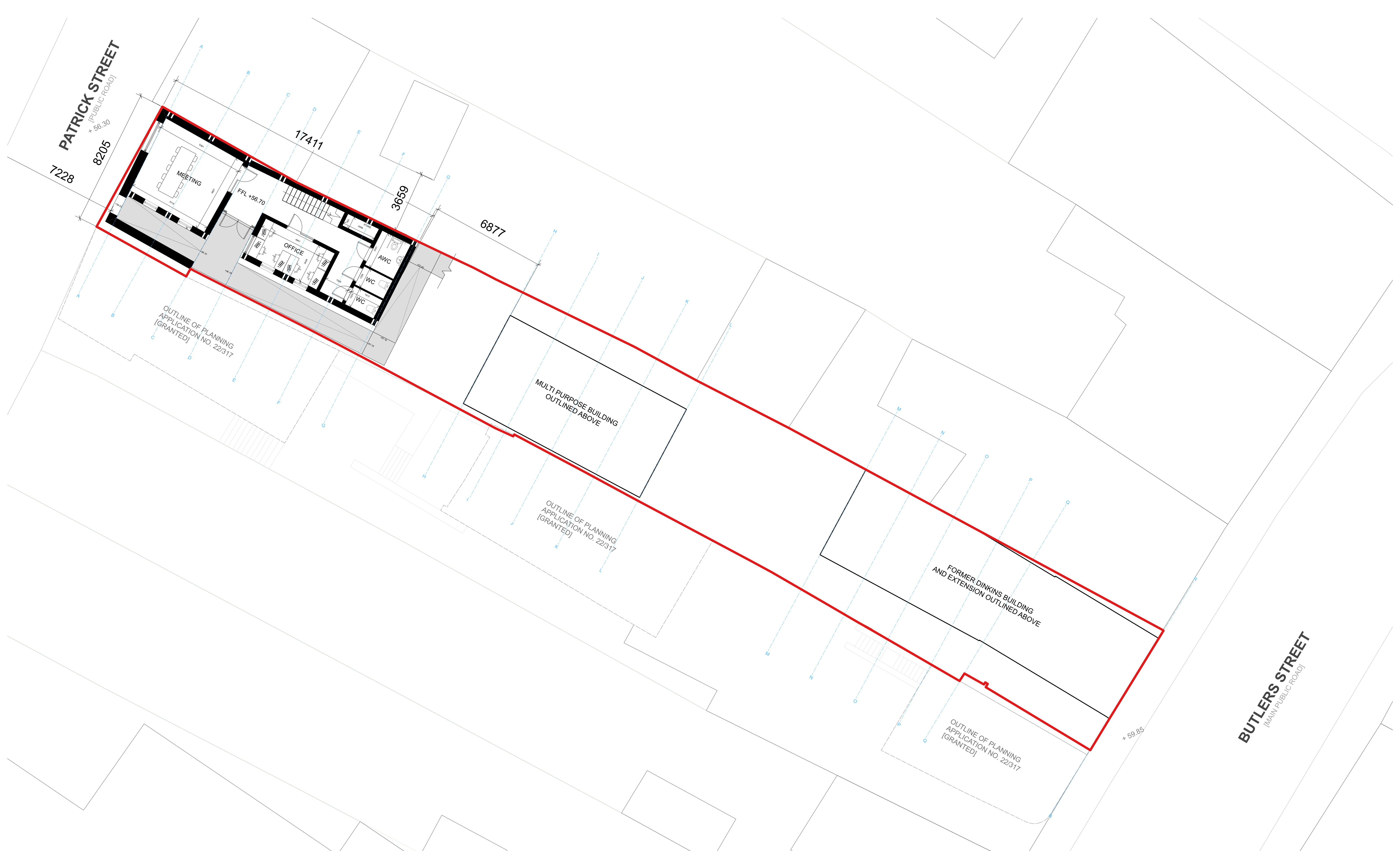
Existing Ground Floor Survey 01 Scale: 1:100