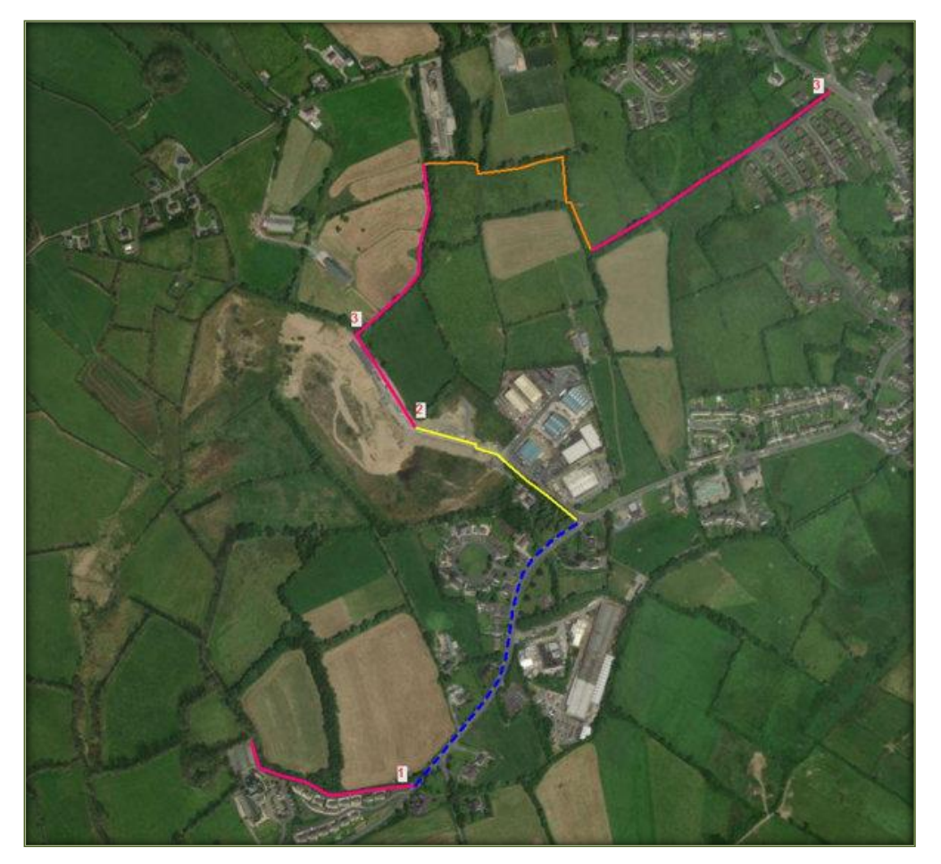
Figure 2 – Route and Sections of Proposed Works