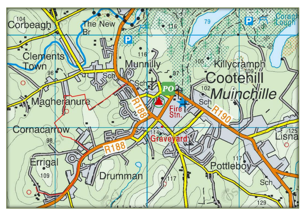
Figure 1 – Site Location Map. The Proposed Route is Outlined in Red.

The proposed route of the Cootehill Greenway has been outlined in Figures 3-4 and an aerial photograph of the route is shown in Figure 5.