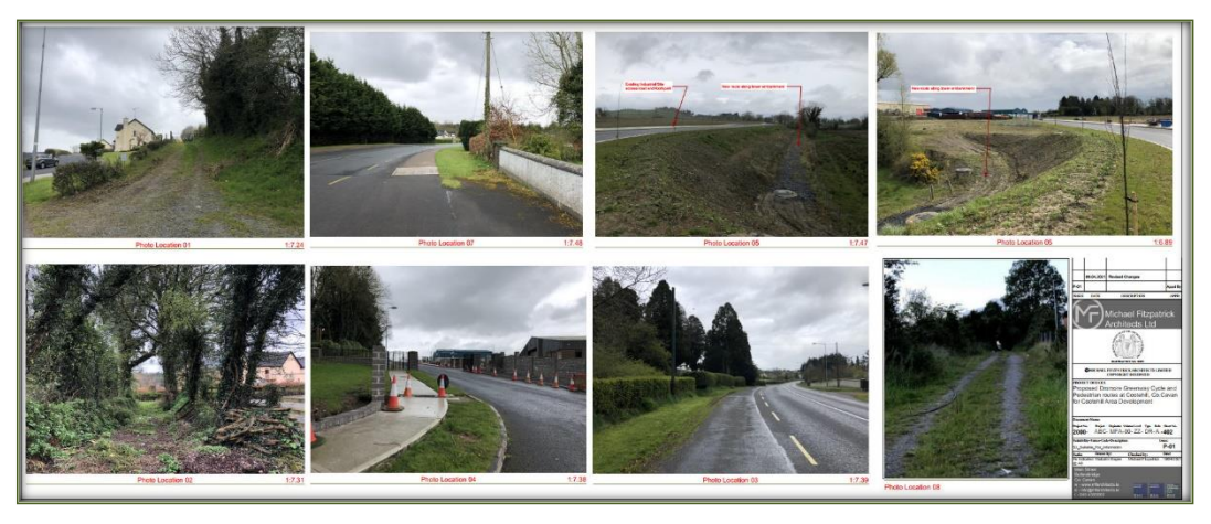
Figure 1b – Proposed Route (Prepared by Michael Fitzpatrick Architects Ltd)