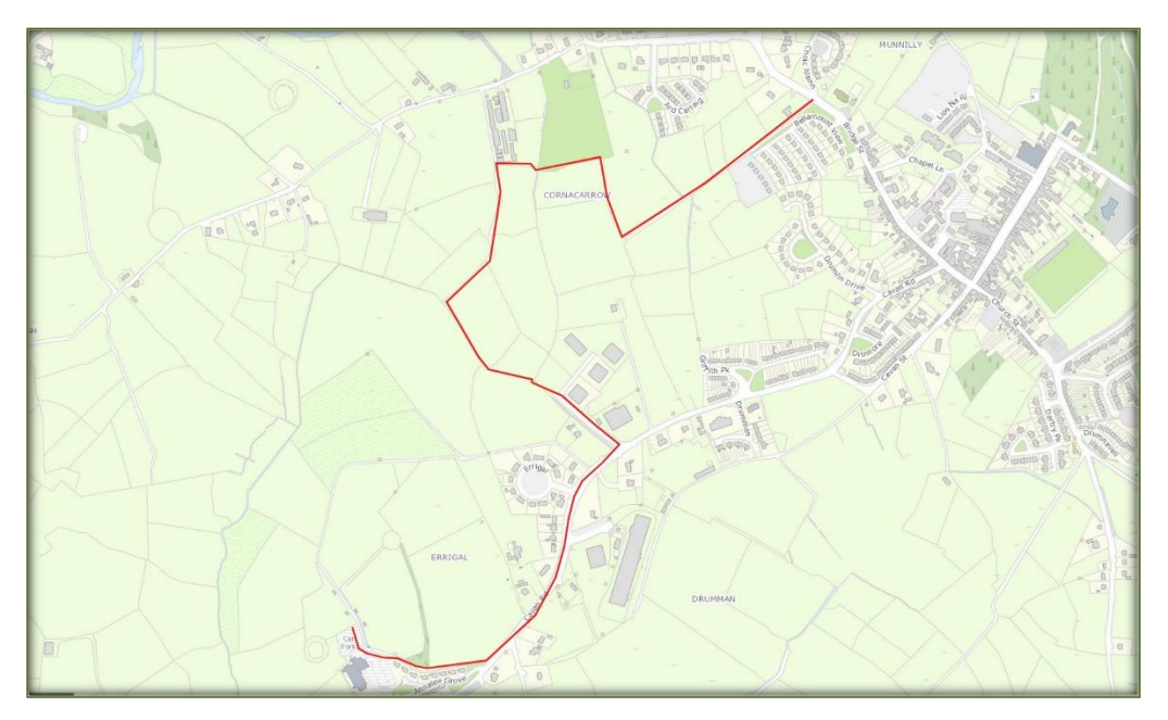
Figure 2 – Site Location Map showing the Proposed Route