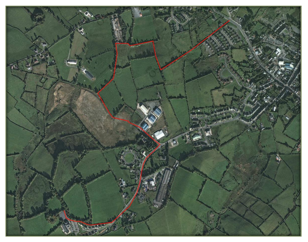
Figure 4 – Aerial Photo of the Proposed Route