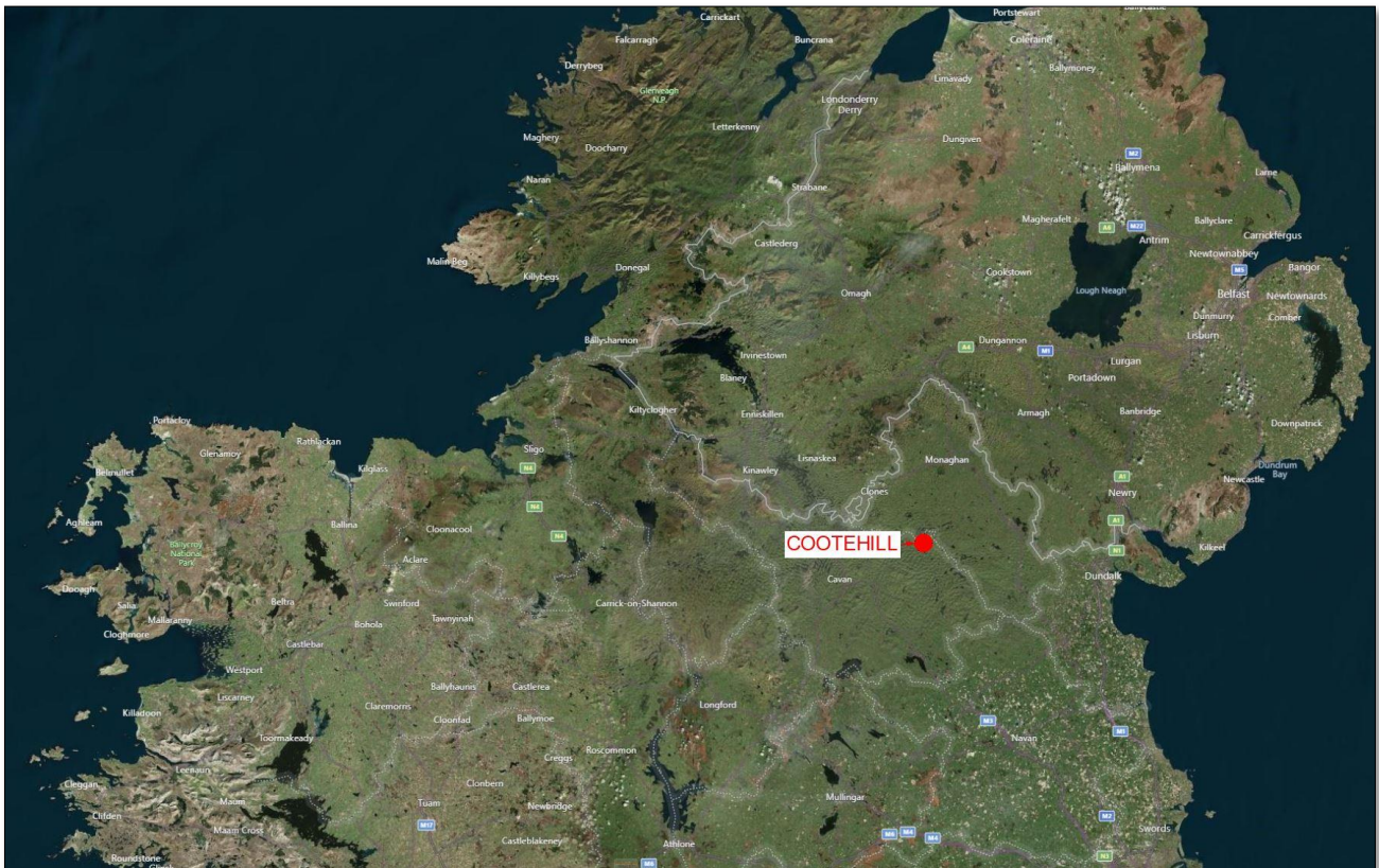
Fig. 1.1 - Development Location – Cootehill, Co.Cavan

The proposed development is for the outline of 5 no. fully serviced sites for future enterprise units including new service road accessed via Cootehill Enterprise Park, street lighting, upgrade of existing site services including connections to services, boundary treatment & landscaping.