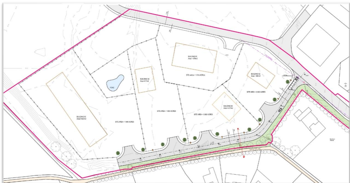
Figure 1.3 - Site Plan of the proposed service road