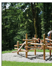
TP04 - Climbing Structure - Image 01 NTS