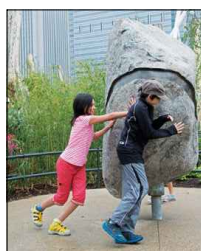
TP11 - Turning Stone - Image 01 NTS