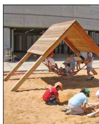
TP16 - Rope Nest - Image 01 NTS