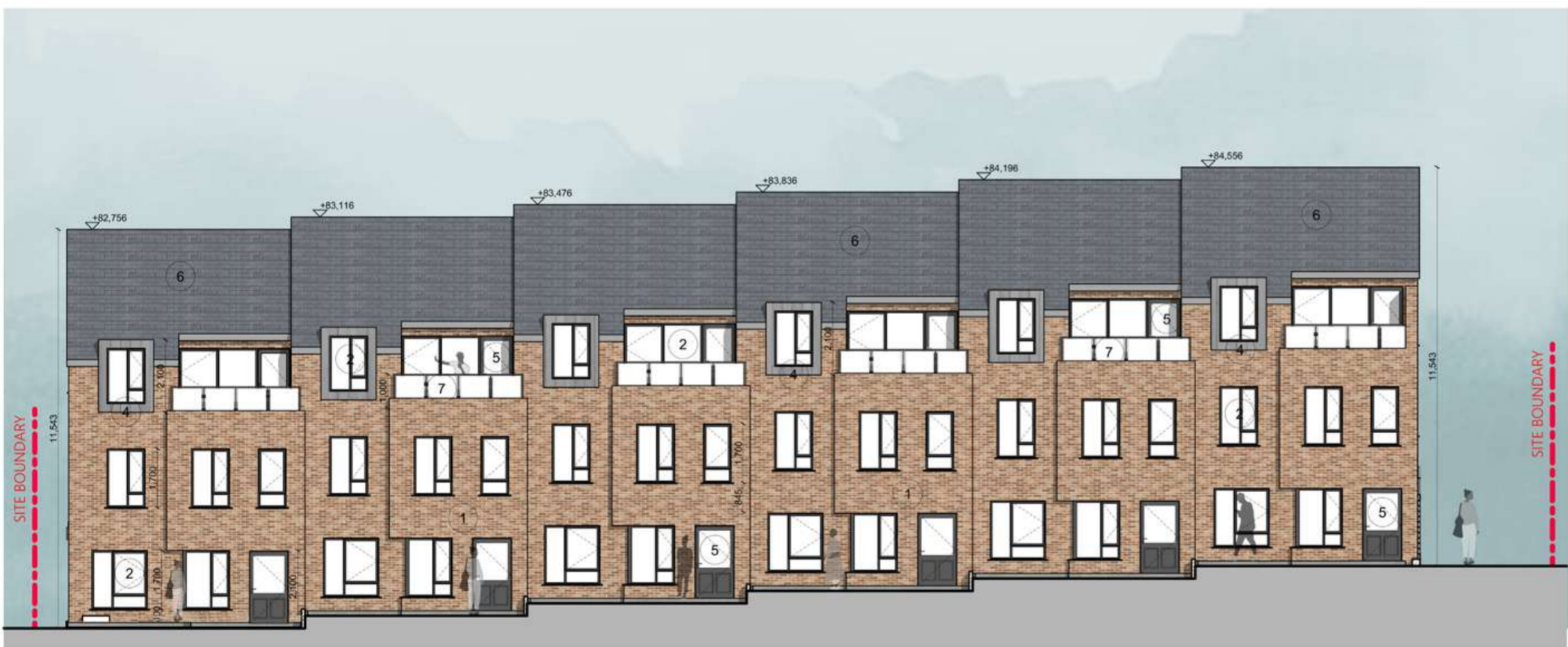
E-05 ELEV-05 Block B Proposed Rear Elevation 1:150