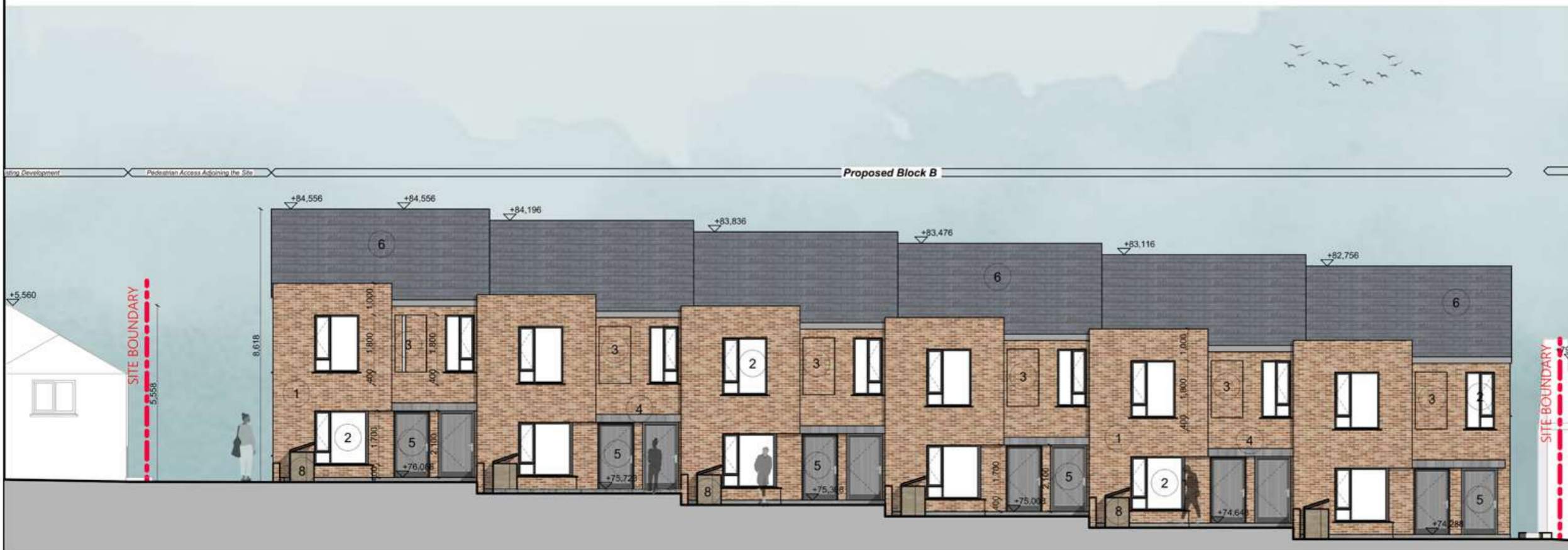
E-07 ELEV-07 Block B Proposed Front Elevation Facing onto St. Brigids Terrace 1:150