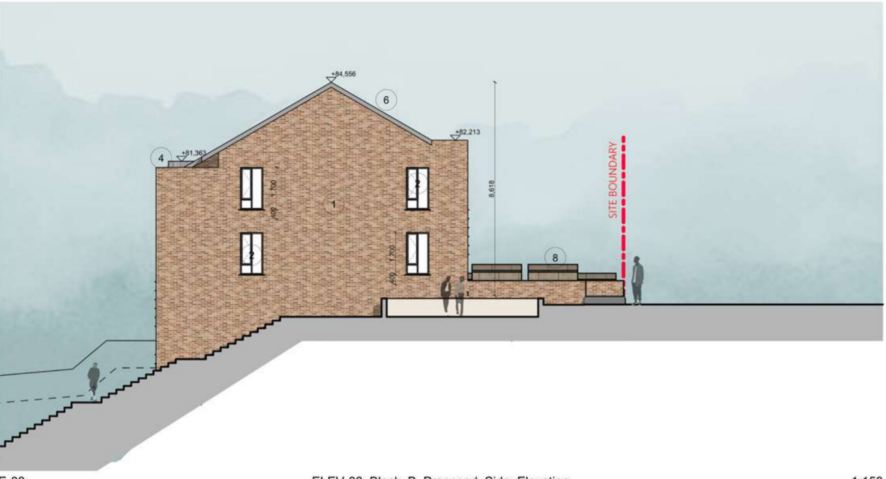
E-08 ELEV-08 Block B Proposed Side Elevation 1:150