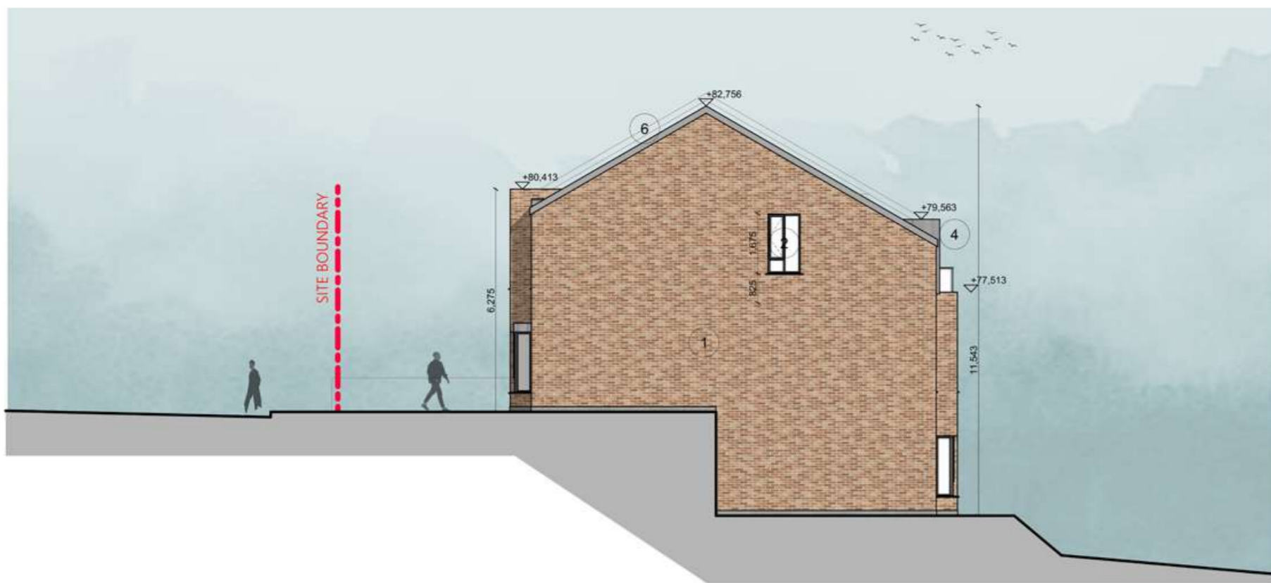
E-06 ELEV-06 Block B Proposed Side Elevation 1:150