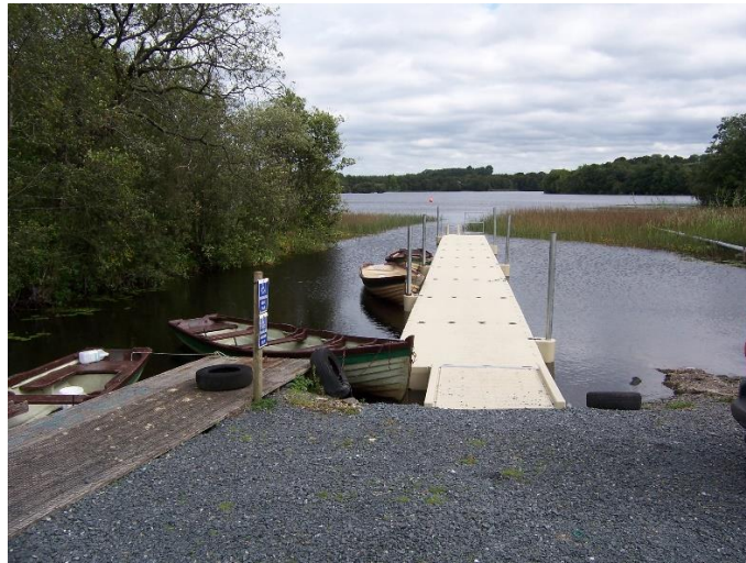
Above : Disability friendly floating jetty on Annagh Lake, Butlersbridge, Co. Cavan funded under the Leader Programme 2014-2022

The community group applied for funding to erect a new floating jetty / pontoon including gangway and all associated site works at the angling facility on Annagh Lake in Butlersbridge, Co. Cavan. The new jetty will allow for much safer access to boats by fishermen using the lake and will encourage and attract visiting anglers and locals to avail of the trout fishing in Annagh Lake.