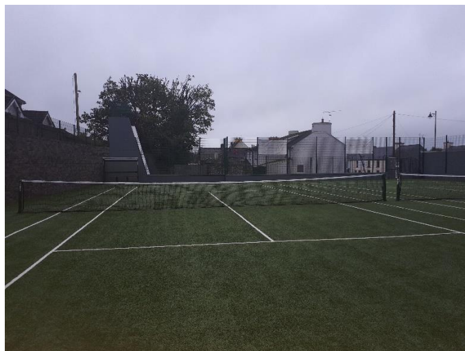
Above : Ballyjamesduff Multi-Use Games Area funded under the Leader Programme 2014-2022

The community group applied for funding to re-instate the existing disused and derelict tennis court facility into a Multi-use Games Area (MUGA). The works included the reconstruction of the boundary wall, reinstall fencing on existing boundary areas, installation of a new surface area to allow for a range of sports such as handball, basketball, tennis and a much needed community space for the town.