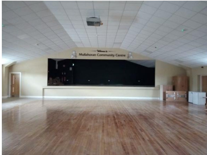
Above : Mullahoran Community Centre funded under the Leader Programme 2014-2022