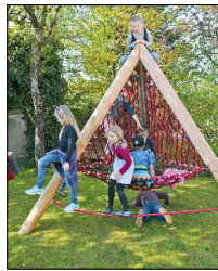
TP13 - Rope Pyramid - Image 01 NTS