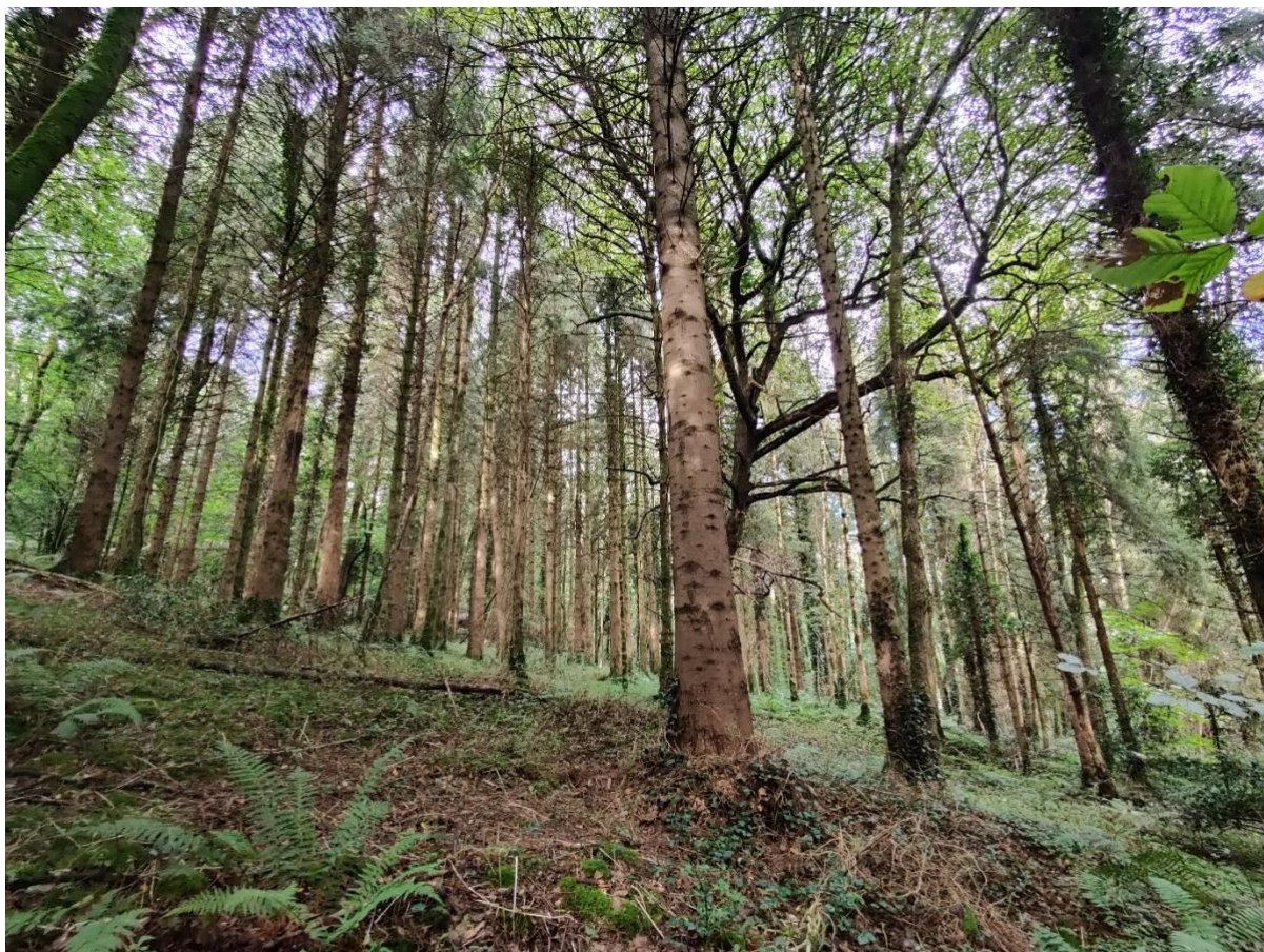
Figure 4.2 (Mixed) Conifer Woodland