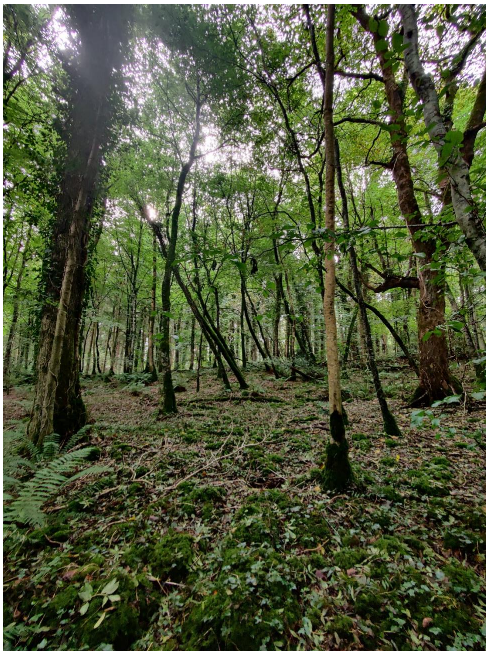
Figure 4.1 (Mixed) broadleaved woodland