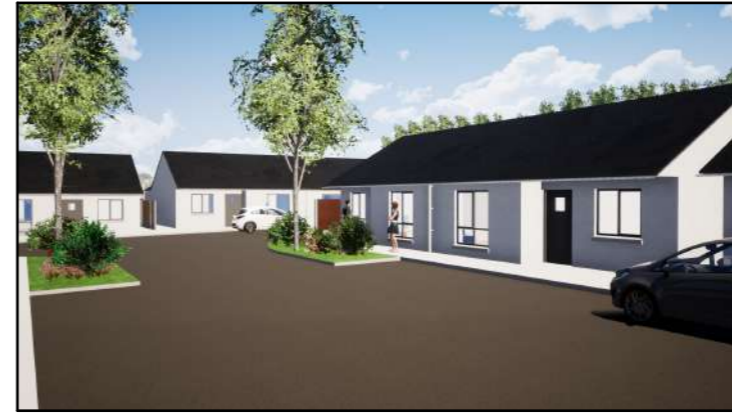
View 03 - Plots 6-10