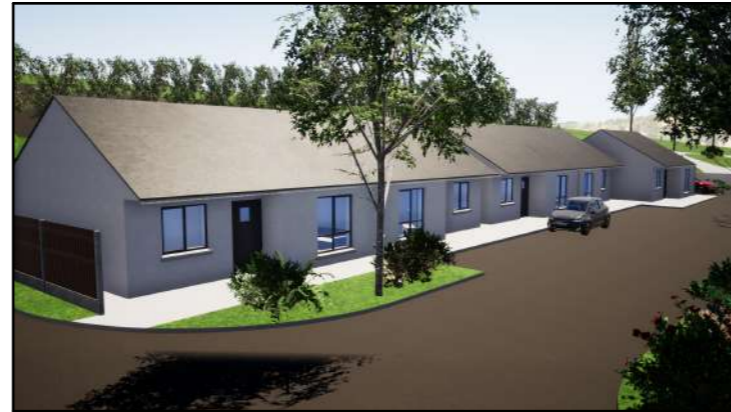
View 05 - Plots 9-13