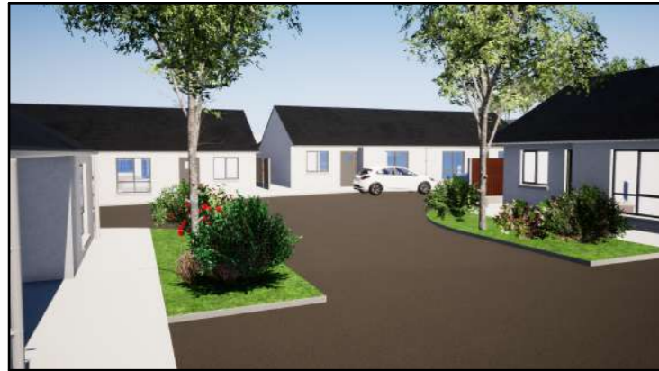
View 04 - Plots 6-9