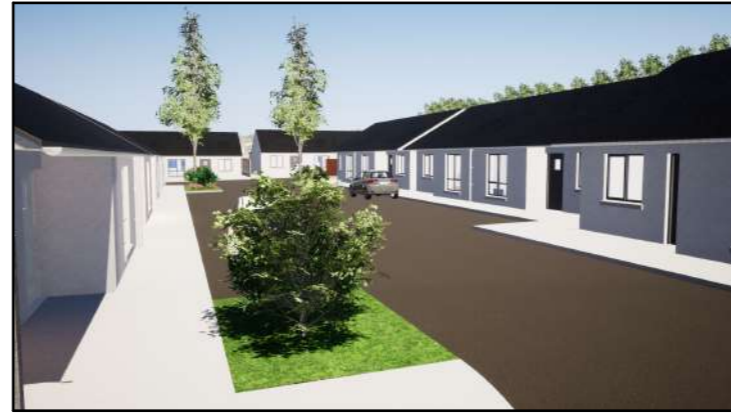
View 02 - Plots 1-13