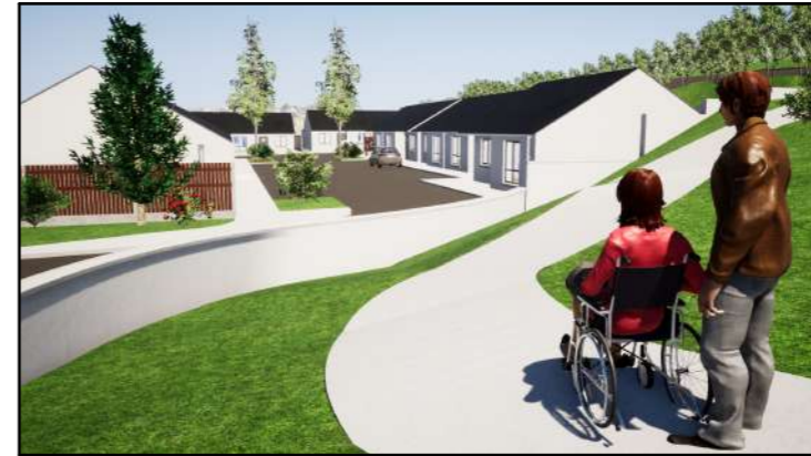
View 06 - Open Space