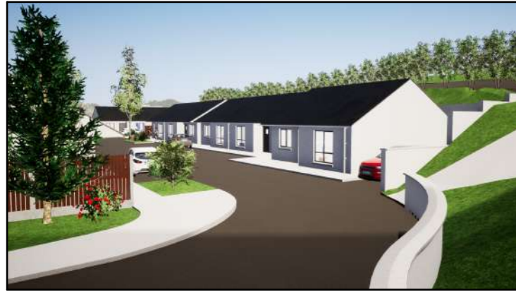
View 01 - Site Entrance