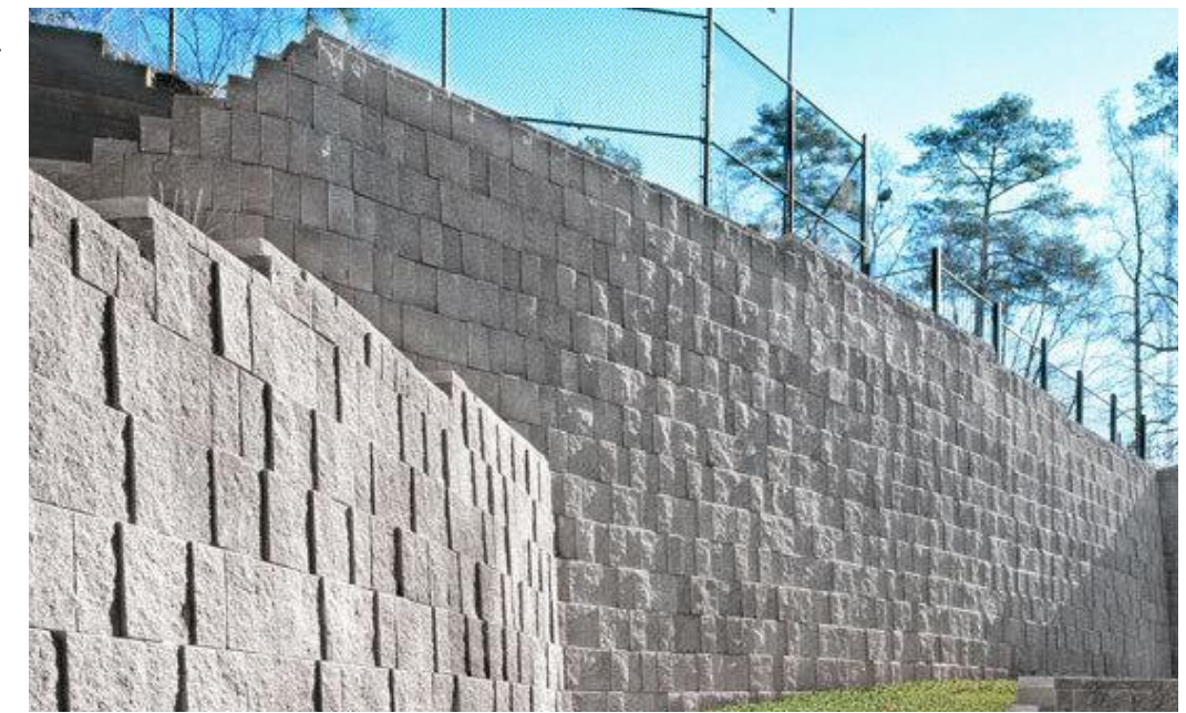
Maccaferri wall example

Note: Site Section & RC wall Details to Engineers Specification and Drawing