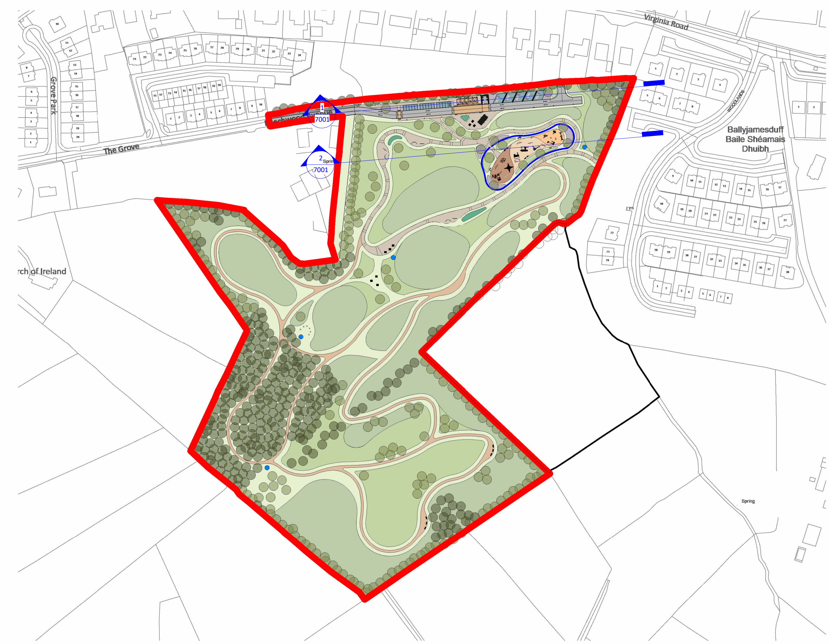
3 Key Plan - Section Sheet 2 1 : 2000