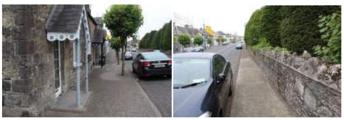
Fig 39. View south-east along N3 beside estate cottages and Fig 40. Footpath along church boundary on N3