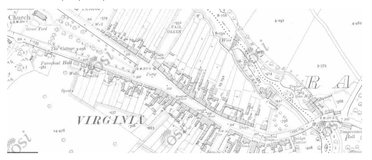
Fig 4. Extract from Ordnance Survey Map (1911)

The Ordnance Survey Map of the area (see below), dating to the 1911, shows a more developed Virginia town. Several buildings are depicted including the parochial house, dispensary, hotel, constabulary, school, smithy, and courthouse. The 'fair green' has moved to the rear (north) of the courthouse. A pump is depicted in the road in front of the courthouse.