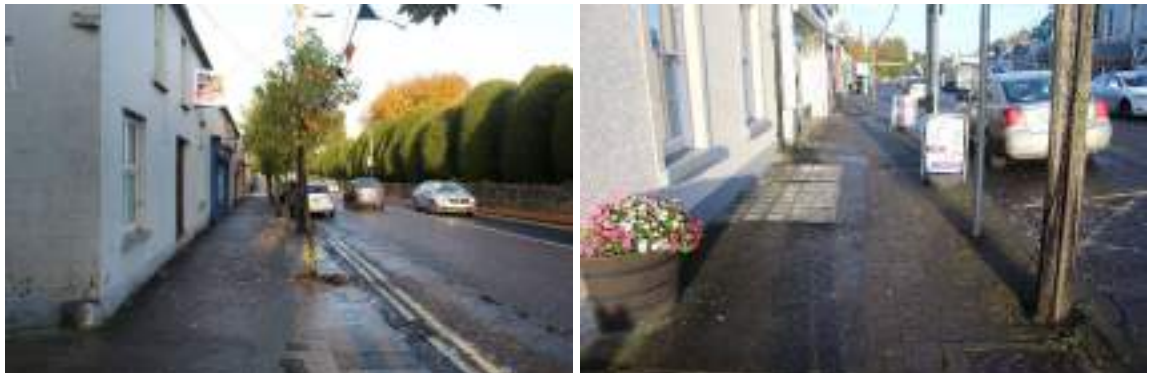
Fig 31&32. View north-west along R194 (LHS) and Virginia Main Street (RHS)