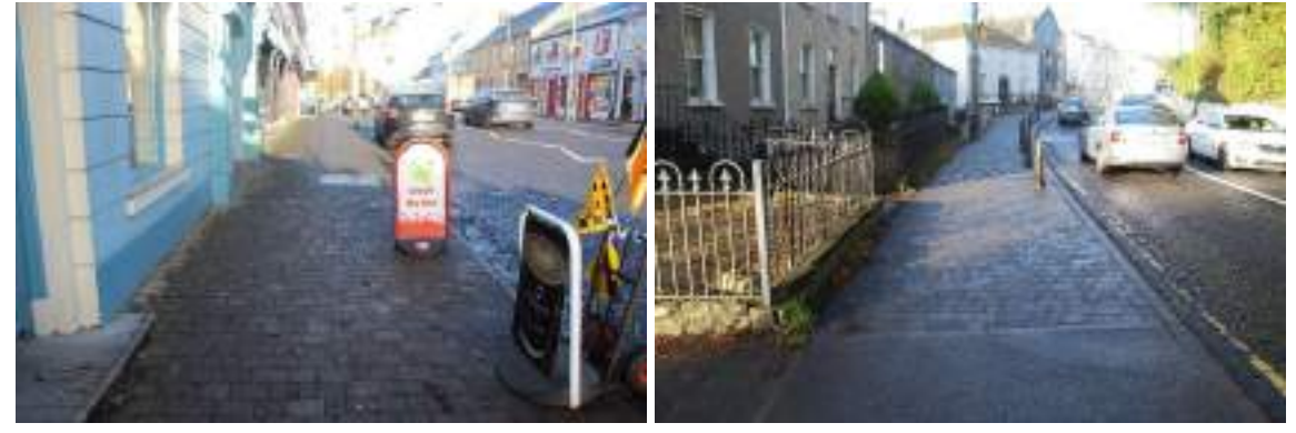
Fig 33&34. View north-west along southern footpath

Fig 31&32. View north-west along R194 (LHS) and Virginia Main Street (RHS)