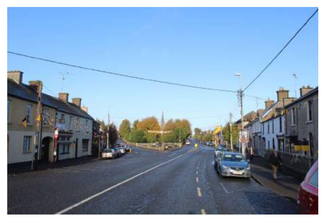
Fig 20. Proposed location of bus stops on either side of the road