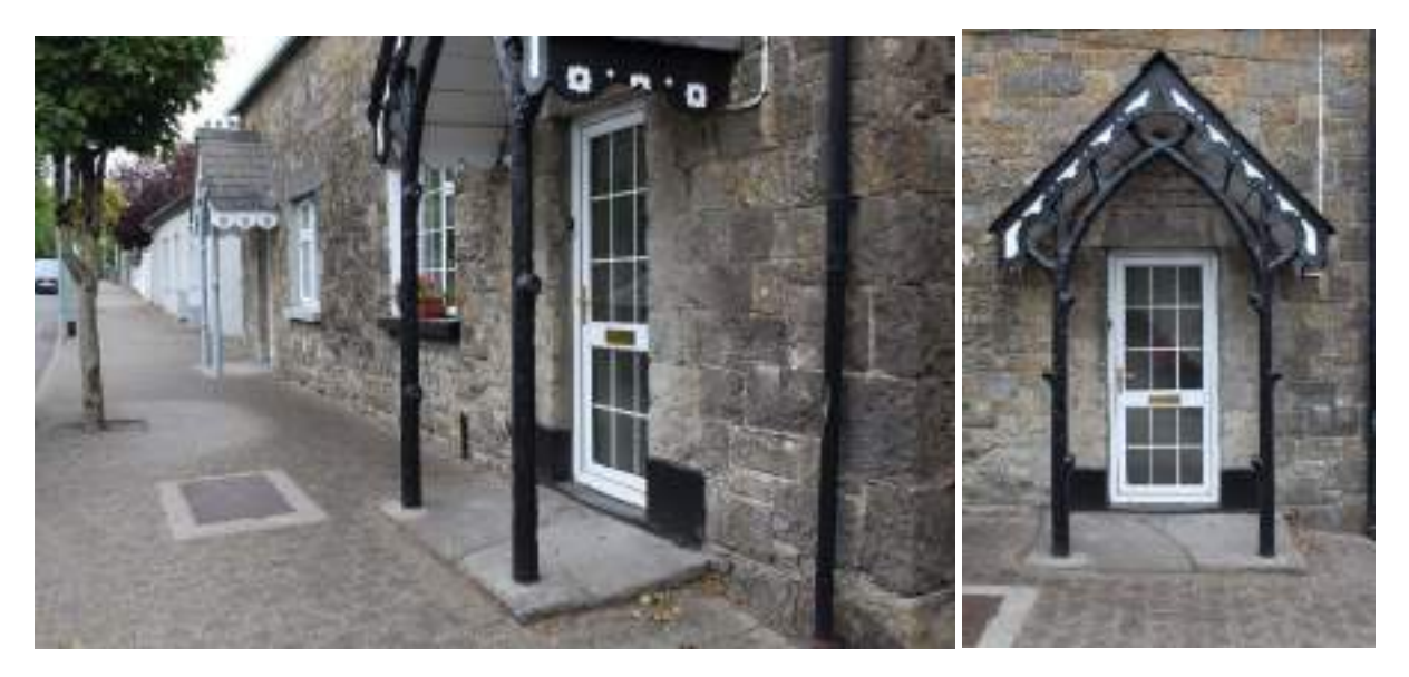
Fig 9&10 Rustic entrance ensemble of the estate cottages with large limestone entrance threshold

Of particular significance are the two surviving large limestone entrance thresholds to the former estate cottages along the N3 as shown in fig 9 and 10. These form an integral element of the designed entrance ensemble intended to evoke a rustic charm. The thresholds have unfortunately been removed to the four estate cottages to the south-east. These estate cottages and their entrances are identical to the estate cottages along R194 just outside the scheme boundary.