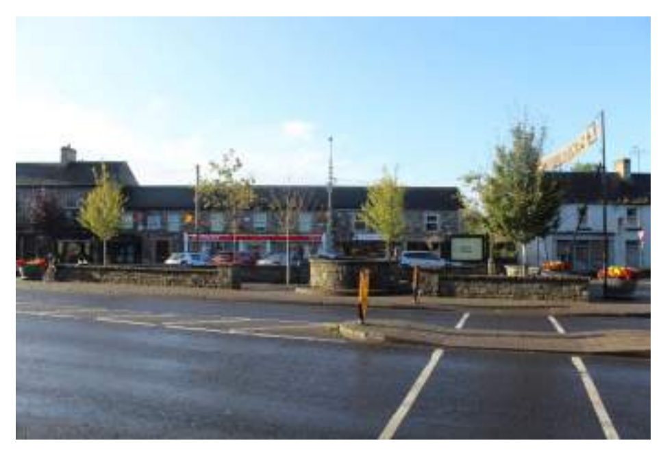
Fig 16. Amenity area with well

Fig 15. Photograph and enlarged section showing water pump by Robert French (1841-1917) of The Square, Virginia taken between 1880-1900. Taken from The Lawrence Photograph Collection (The National Library of Ireland Online Catalogue).