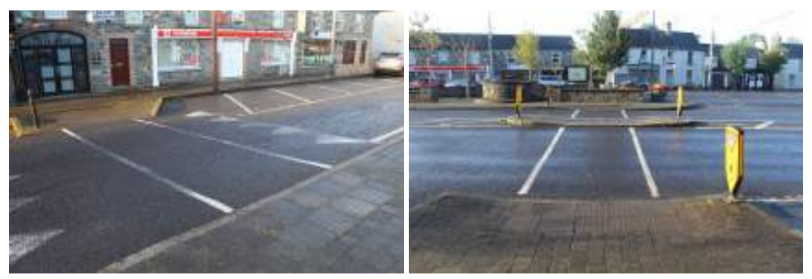
Fig 41&42. Pedestrian crossings near amenity area