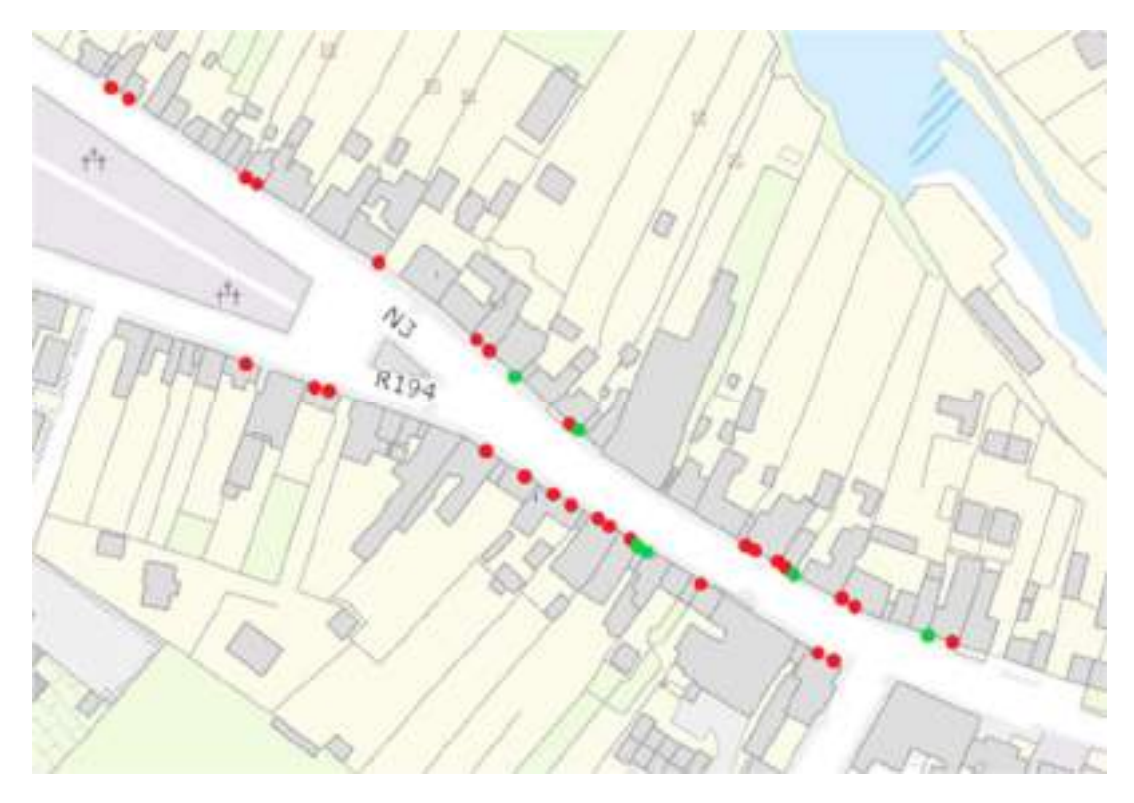
Fig 11. Map showing the location of street furniture listed in Table 3. below. (Base map from <u>http://webgis.buildingsofireland.ie/HistoricEnvironment/index.html</u>). Red for steps/thresholds and green for bollards/jostle stones.