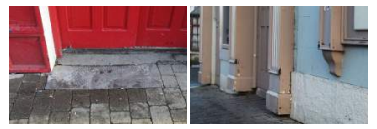
Fig 7. Former threshold in front of The Whistle Stop Bar indicating the location and size of former door openings and Fig 8. Steps removed outside The Riverfront Hotel resulting in the architraves and pilaster not meeting the footpath surface.

The steps and thresholds included in this inventory (table 3 and Fig 9) are technically part of the building curtilage and not street furniture. However they are in close proximity to the pavement resurfacing scheme and may mistakenly be overlooked during works and therefore inventoried in this report. The steps and thresholds are typically limestone often with evidence of a dressed finish. In the case of The Whistle Stop Bar, the thresholds remaining along the footpath are a reminder of the historic openings to the building which have since been altered (Fig 7). The Riverfront Hotel is an example where the mistaken removal of historic steps has resulted in door architraves and pilasters hoovering above the footpath (Fig 8).