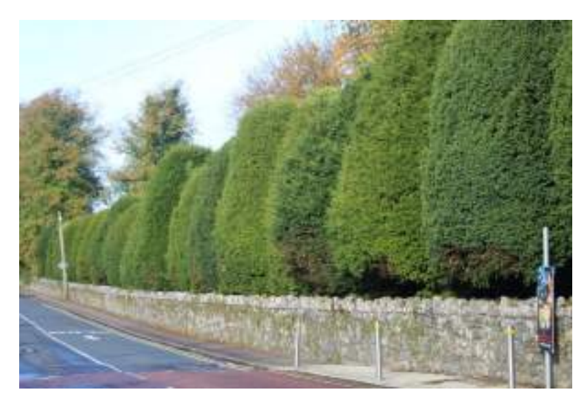
Fig 22. Rubble stone boundary wall to St. Lurgan's Church