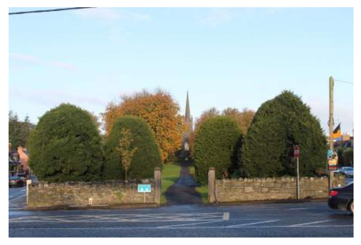
Fig 30. Town entrance to Lurgan Church