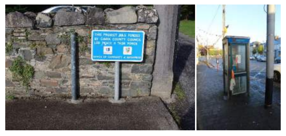
Fig 25 and 26. Examples of redundant street furniture in Virginia – unused poles and phone boxes