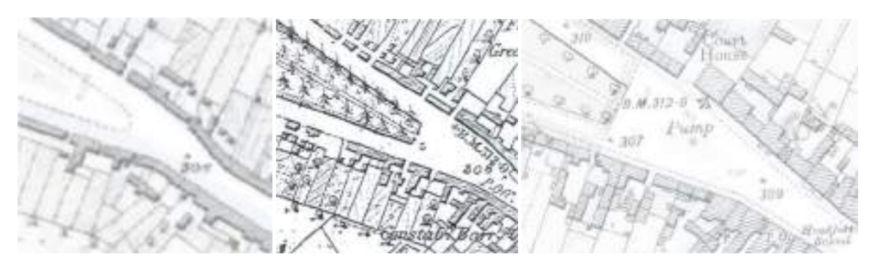
Fig 12,13,and 14. Ordnance survey map extracts of location of present day amenity area from 1836, 1878 and 1911 (from left to right)