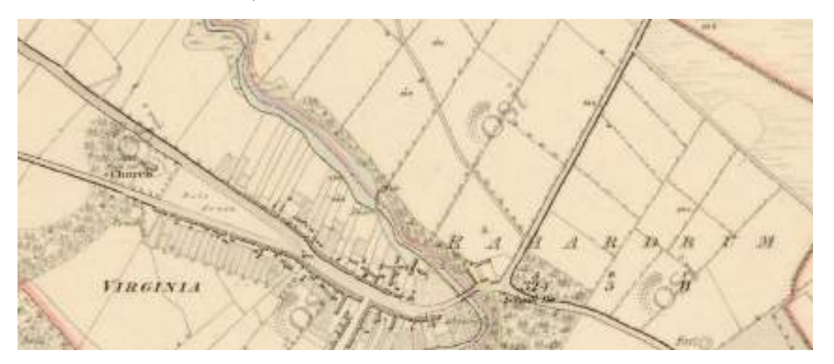
Fig 3. Extract from first edition Ordnance Survey Map (1836)

The first edition Ordnance Survey map of the area (see below), dating to the 1836, shows Virginia town as a linear settlement situated along a roadway. The 'school house' is situated at the southeast end of the town, and the 'church' (Anglican) is situated at the top of the town, where the roads to Cavan and Ballyjamesduff meet. A 'fair green' is also shown immediately in front of the church. This fair green is the likely location of the market for the town, referred to in historical texts, and dating to the late seventeenth century.