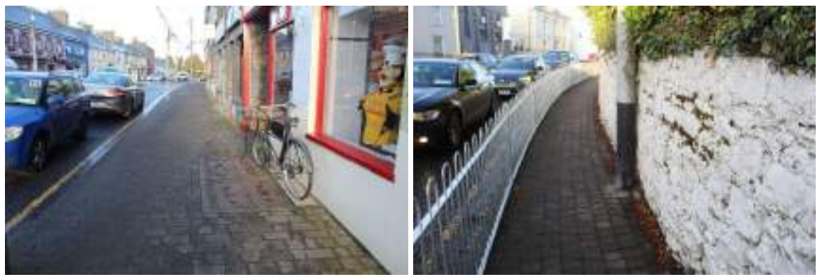
Fig 37&38. View north-west along northern footpath