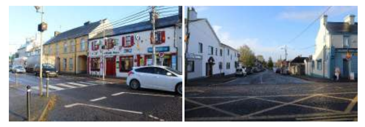
Fig 43. Pedestrian crossing and Fig 44. Junction between N3 and New Street