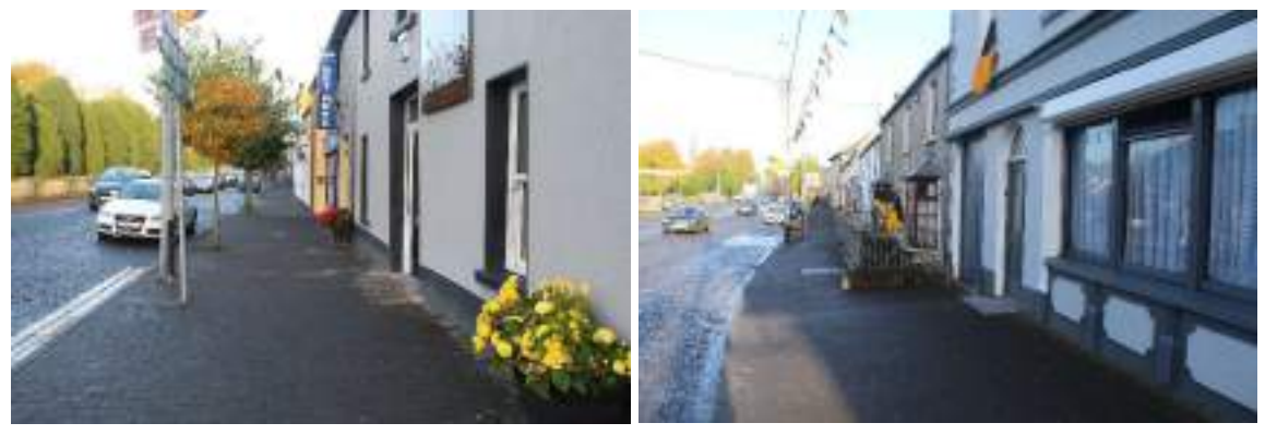
Fig 35&36. View north-west along northern footpath