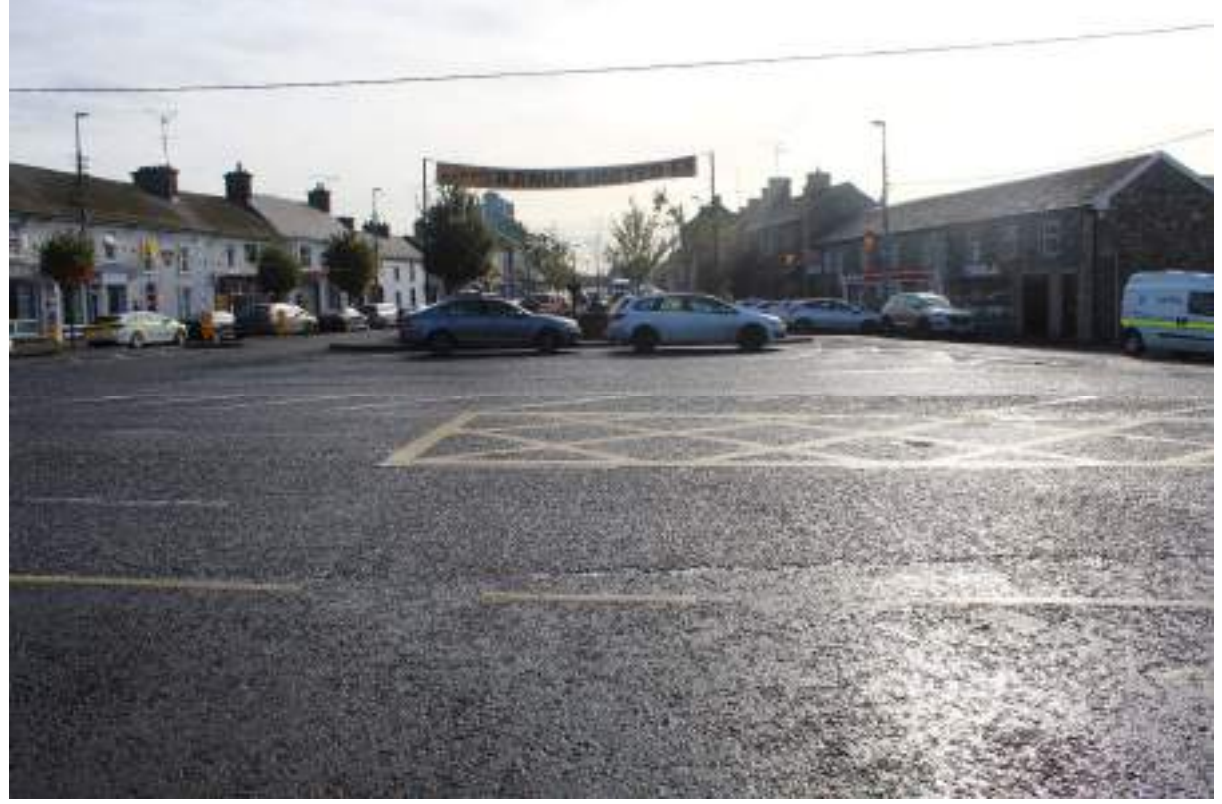
Fig 19 Location of the proposed roundabout

The location of the proposed roundabout was historically a very wide Y-shaped road junction It is currently a road junction which was laid out in the twentieth century.