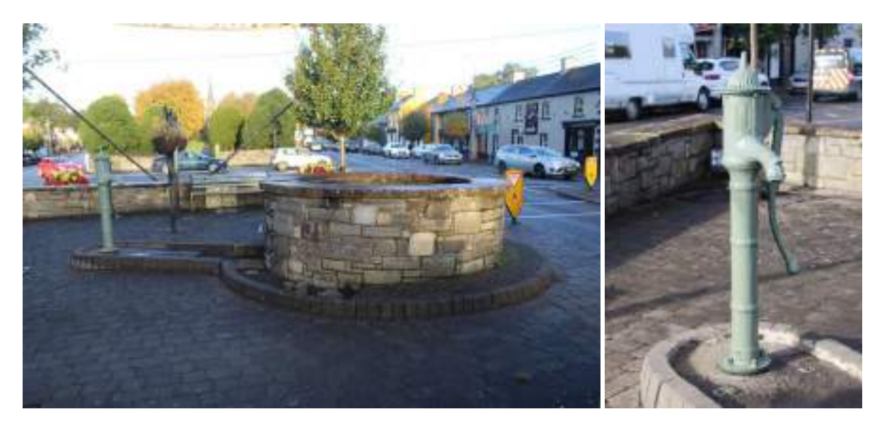
Fig 17. Well and pump and Fig 18. Cast-iron pump