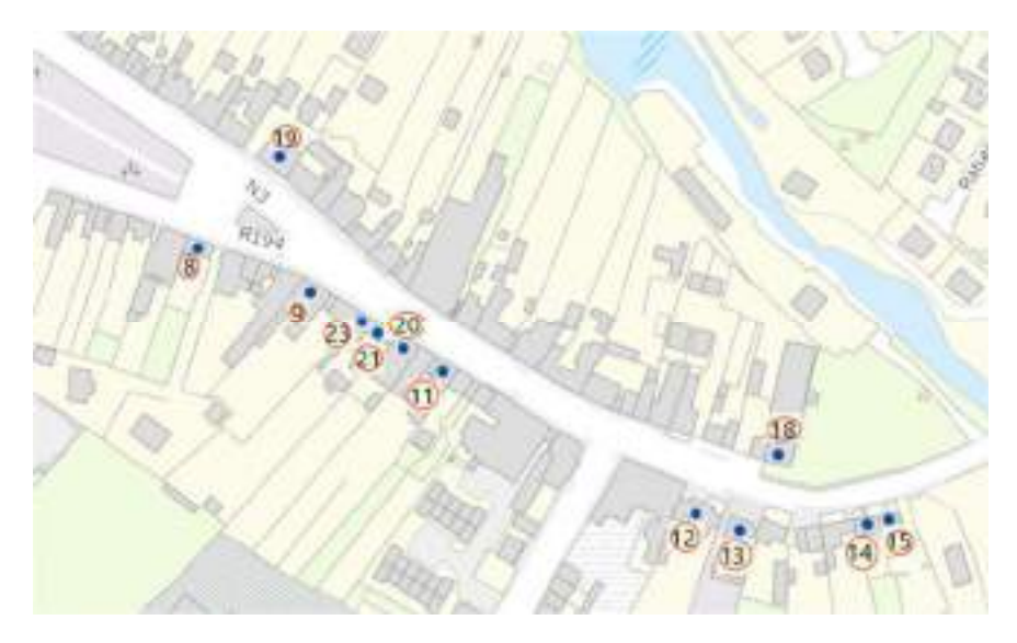
Fig 5. Extract from NIAH building survey of Virginia town. (<u>http://webgis.buildingsofireland.ie/HistoricEnvironment/index.html</u>). Buildings are annotated with numbers for ease of reference with table 2.