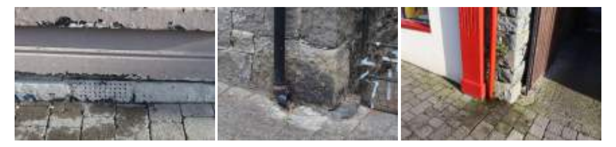
Fig 27. Subfloor vent, Fig 28. Cast-iron rainwater downpipe and Fig 29. Downpipe at footpath surface

Building elements such as sub-floor vents and downpipes should remain unobstructed during construction and following the relaying of the new footpath surface (Fig 27-29). All drainage channels should continue to run freely.